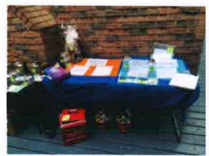
Table offering raffle tickets which are not permitted as a fund raiser

"I have reached out to the City to find out how best to rectify the situation. I have also voluntarily cancelled the raffle and have already returned almost all contributions and am in the process of contacting the raffle participants to provide refunds.