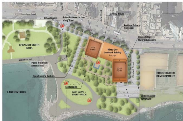
CITY OF BURLINGTON | WATERFRONT HOTEL PLANNING STUDY | EMERGING PREFERRED CONCEPT 2 OCTOBER 31, 2017