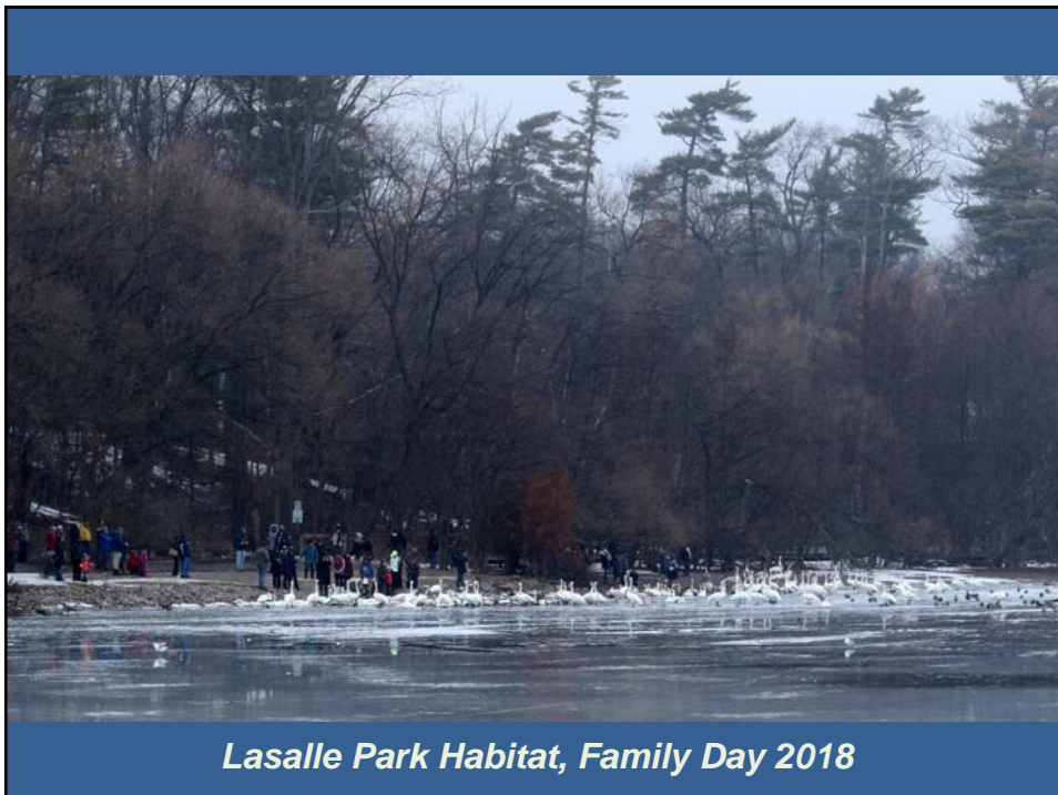
Lasalle Park Habitat, Family Day 2018