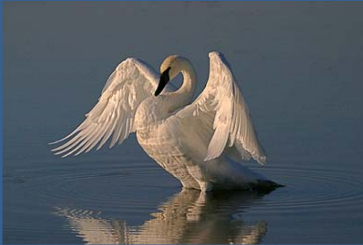
The Trumpeter Swan Coalition