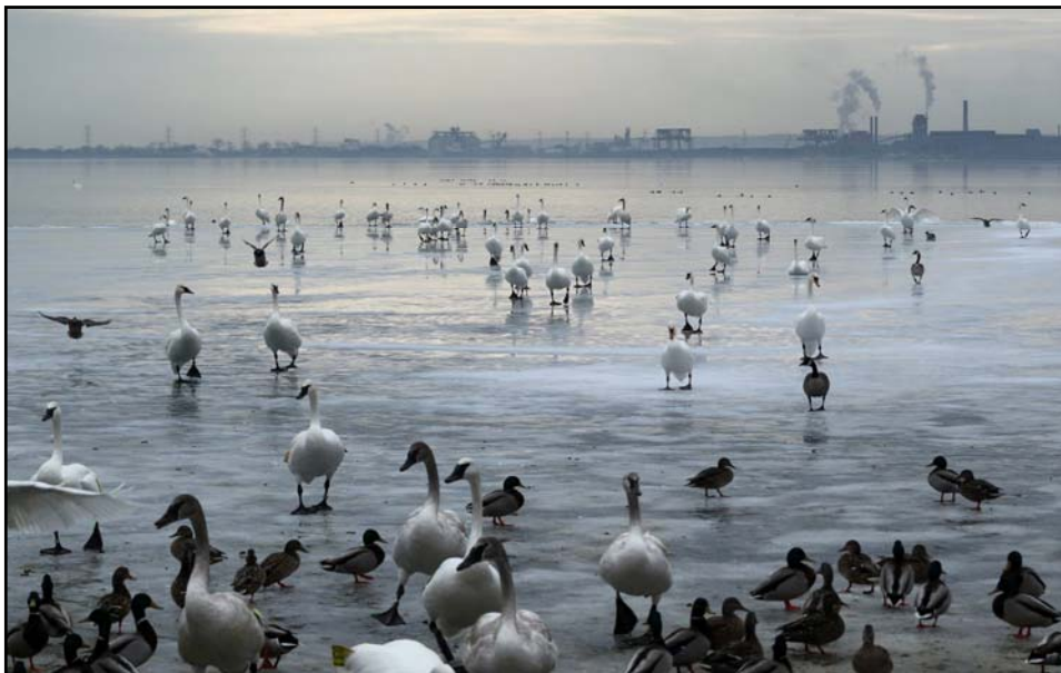
A place of incredible beauty where nature thrives even with the bay's industrial heritage