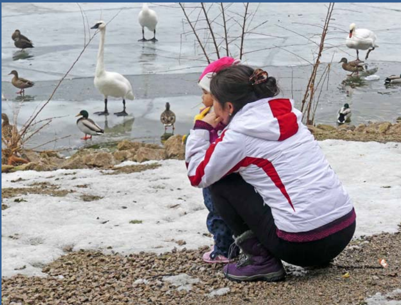
A place where people can enjoy nature up close