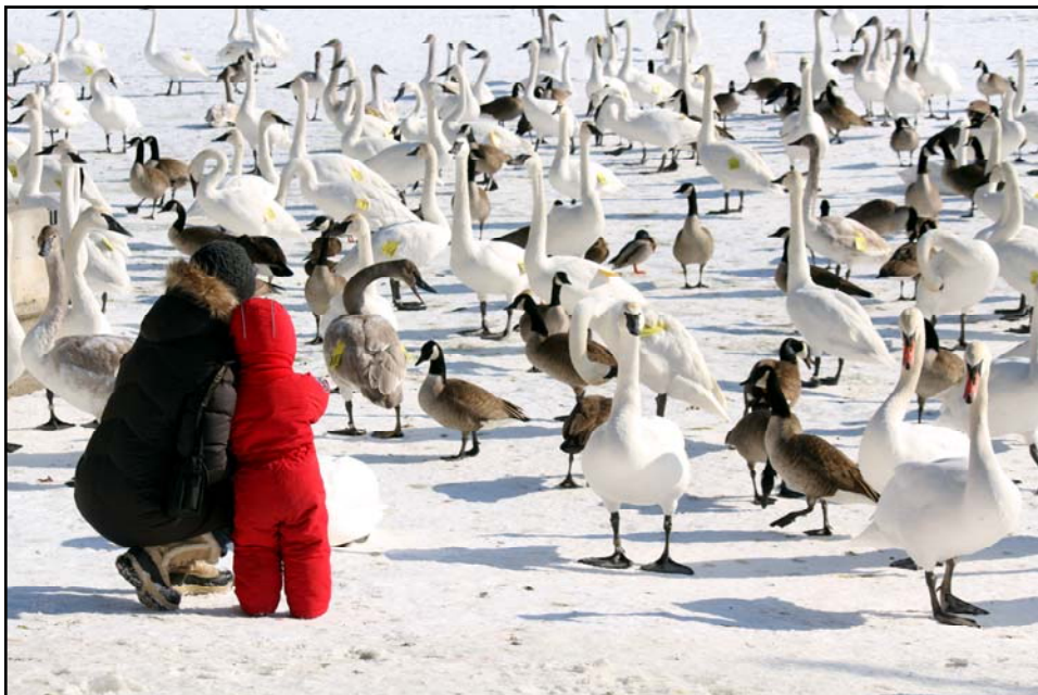
And thousands of tourists to see the Trumpeter Swans