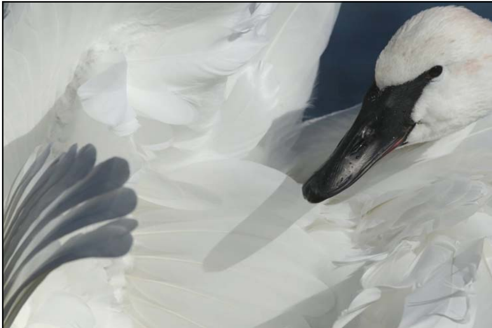
A place that draws thousands of photographers