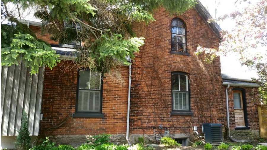
Side elevation (Green Street)