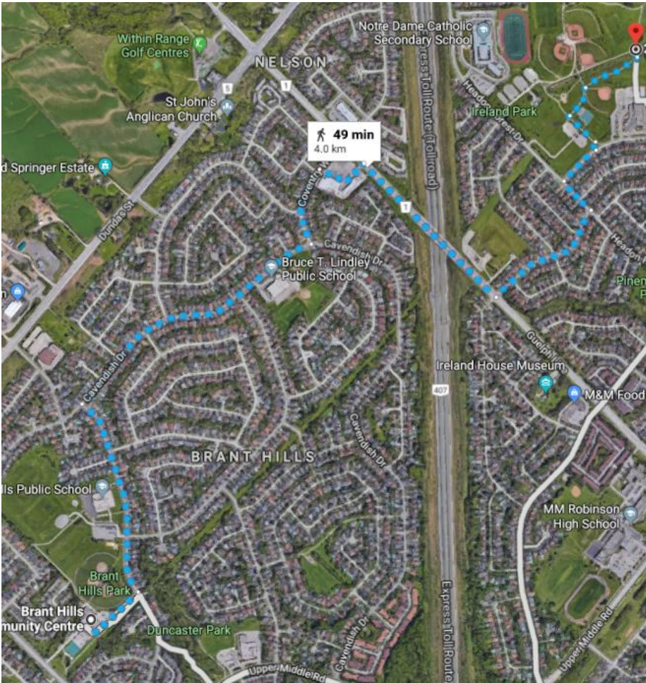
Walking Distance to Ireland Park Splash Pad