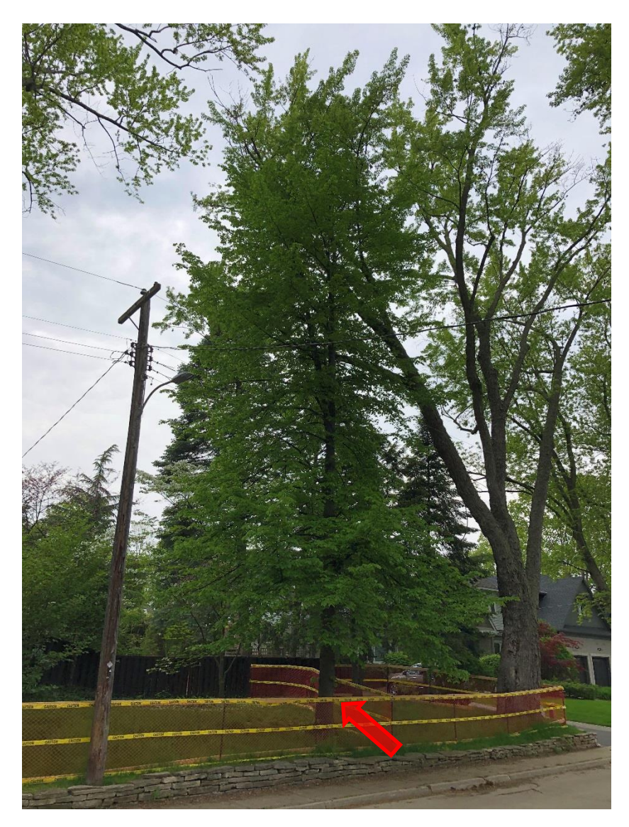
Figure 3: Subject Tree, 31 cm little leaf linden ( Tilia Cordata ).

A site meeting with the applicant was conducted by the City's Manager of Urban Forestry and Supervisor of Forest Planning & Health, who confirmed the siting of the proposed driveway was the best location to preserve trees on both public and private property.