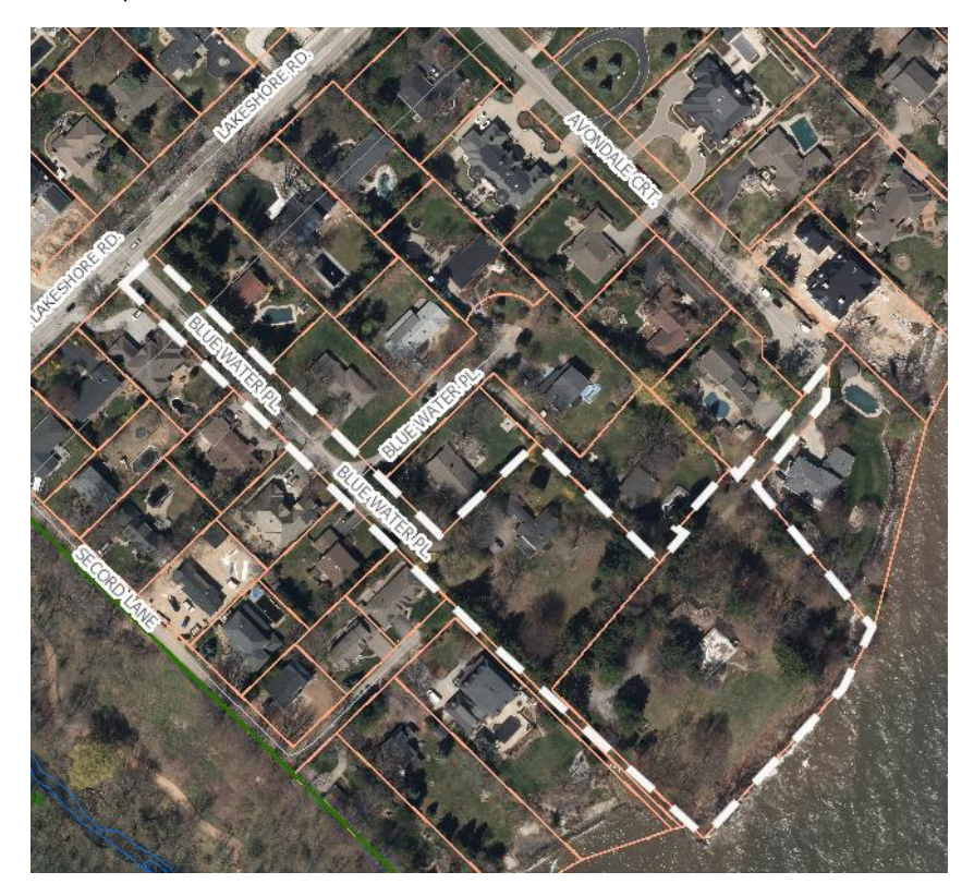
Figure 1 – Air photo (2017) with the subject property outlined

The site is surrounded by low density residential uses (single detached dwellings) to the north, east and west, and Lake Ontario to the south.