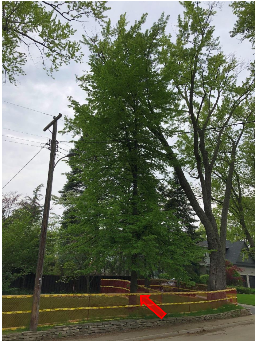
Figure 3: Subject Tree, 31 cm little leaf linden ( Tilia Cordata ).

A site meeting with the applicant was conducted by the City's Manager of Urban Forestry and Supervisor of Forest Planning & Health, who confirmed the siting of the proposed driveway was the best location to preserve trees on both public and private property.