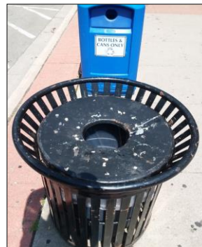
Example: Tree grates and Metal waste receptacles