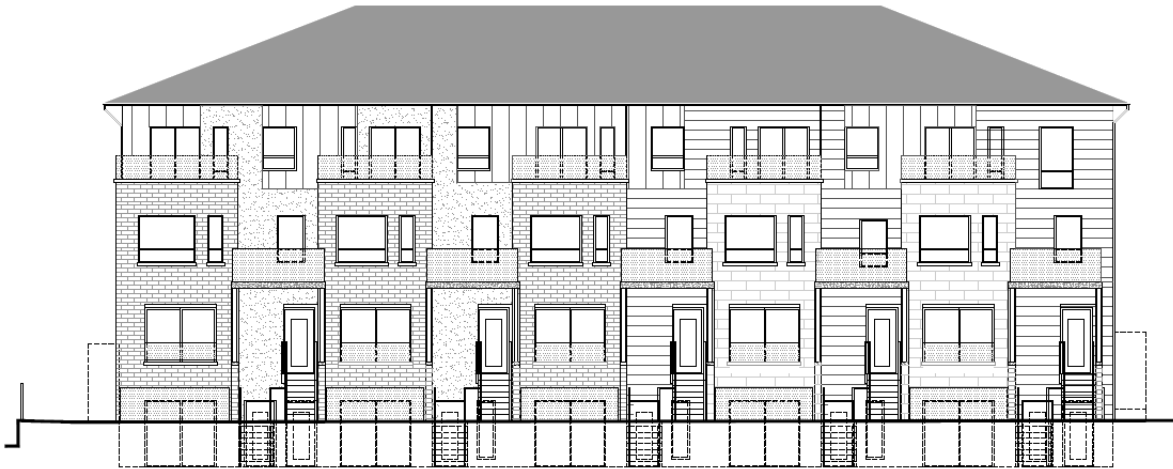
Block 1 – Front View