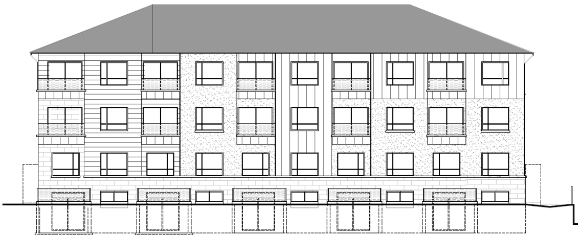
Block 1 – Rear View