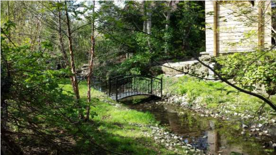
Creek – Monet Bridge on a Fair Day (136 Avondale)