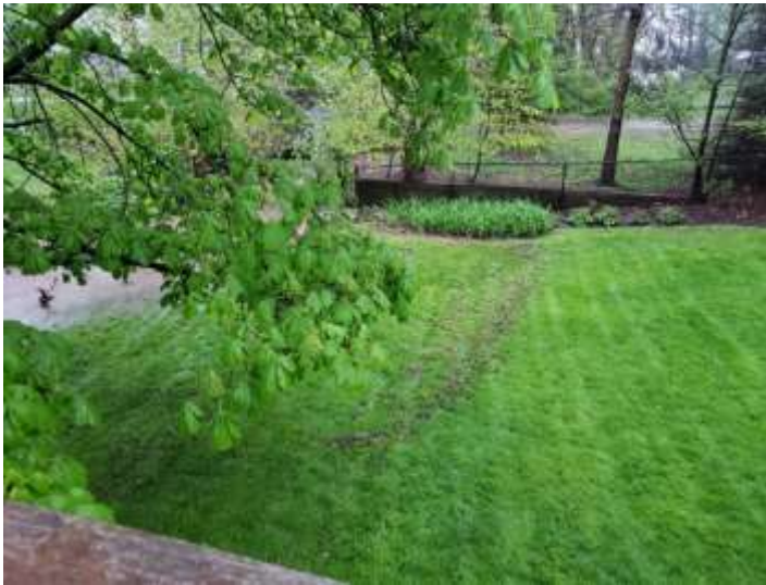
Sat May 25, 2019 6:20pm – 4342 BWP (looking south)

Just 8 minutes later. Shows peak water level debris.