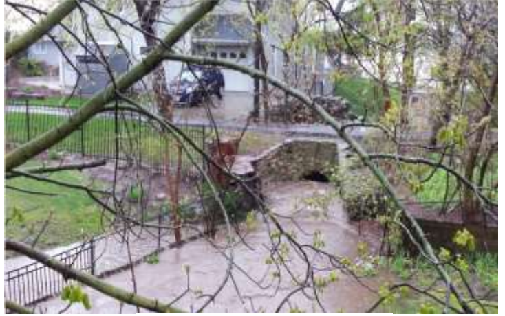
Creek – May 1, 2017