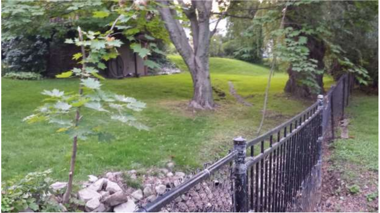
In fair conditions (looking toward 4342 BWP from 105 Avondale Culvert)

Creek surcharge during Burlington Flood - Aug 4, 2014