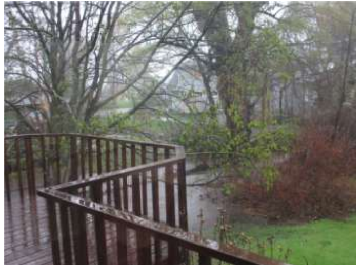
Creek – May 14, 2014