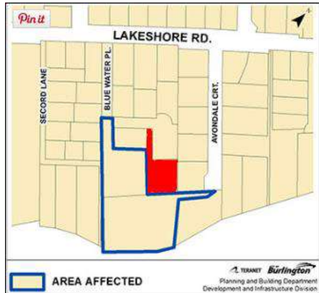
Site at 105 Avondale Court & 143 Blue Water Place (4342 Blue Water Place shown in red)

Major Flooding Events occurred on several dates, not limited to the Burlington Flood of August 2014.