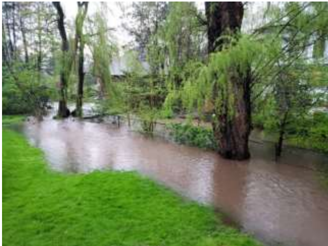
Sat May 25, 2019 6:12pm – 4342 BWP (looking north)

Just this past weekend on Saturday May 25, 2019 following a rainfall and flash flood warning issued by Environment Canada, the creek again surcharged to a level second only to the flood of 2014. The creek level rose above the height of the 105 Avondale laneway culvert which is roughly 3-4 feet in diameter. The current could not drain fast enough and overflowed upstream onto our property at 4342 BWP , seeping into our basement. We took photos and some video.