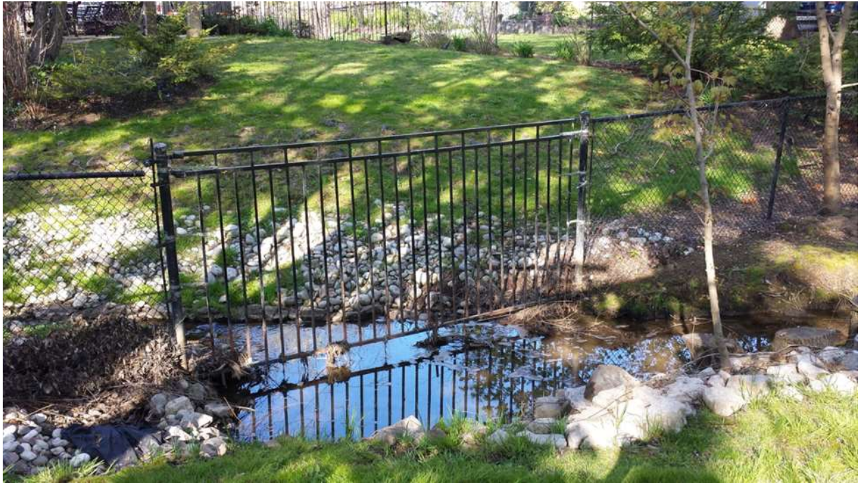
Fence #2 crossing Creek (looking toward 136 Avondale)

Second fence crosses Creek at 136 Avondale & 4342 BWP