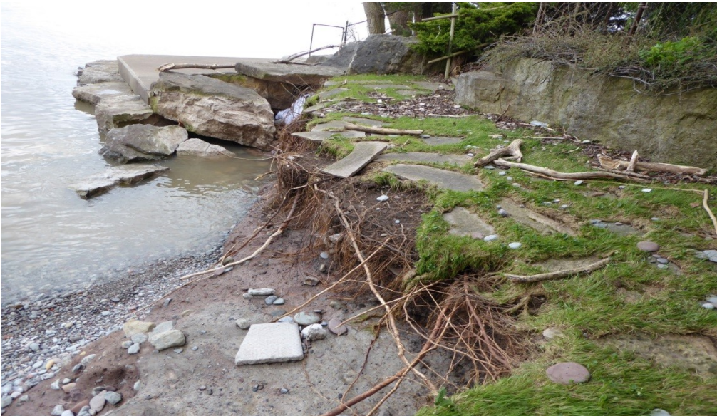
P1000478.jpg 105 Avondale Court May7th 2017

The preexisting retaining wall has washed away and the valley was a watershed runoff area.