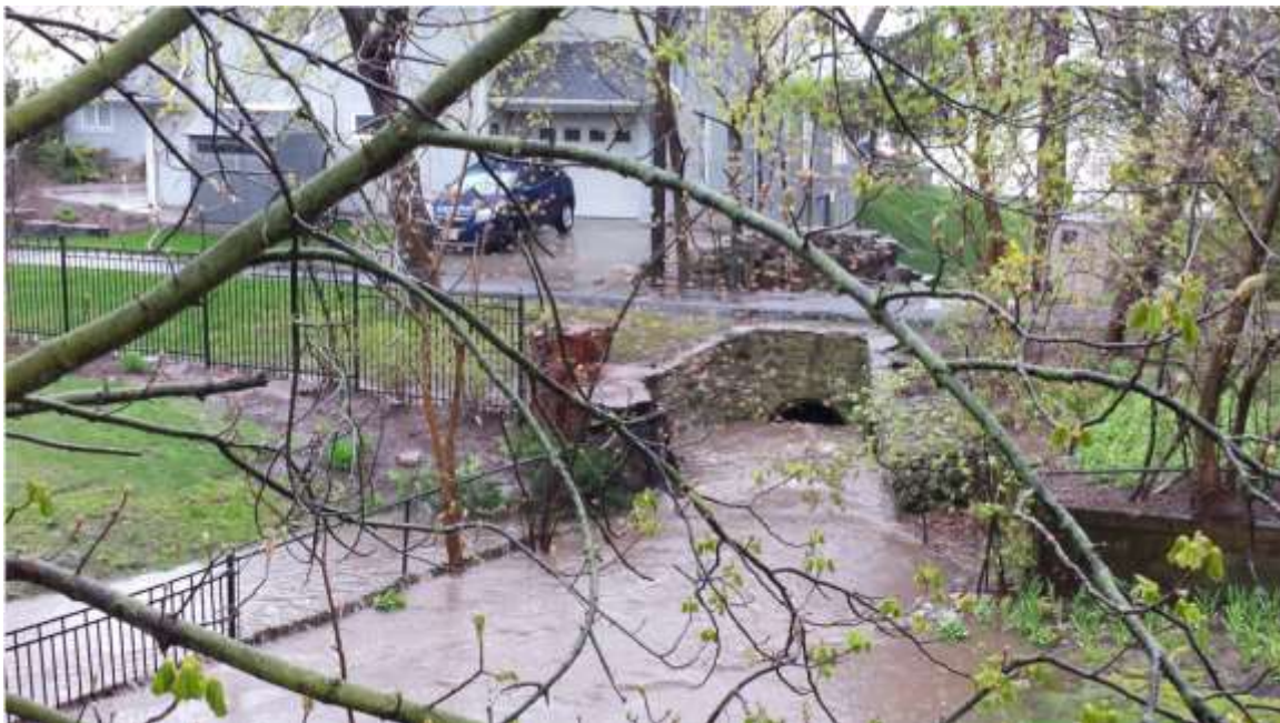
Creek – May 1, 2017 Storm (best comparative view) Storms in 2014 and May 25, 2019 rose above height of culvert