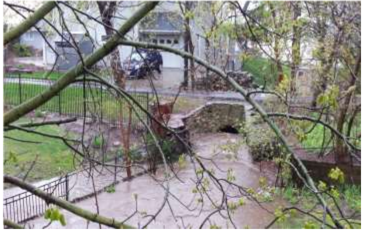
Creek – May 1, 2017