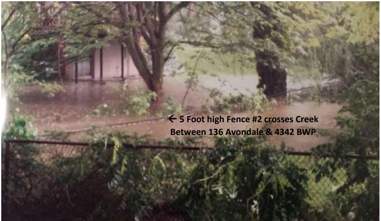
← 5 Foot high Fence #2 crosses Creek Between 136 Avondale & 4342 BWP