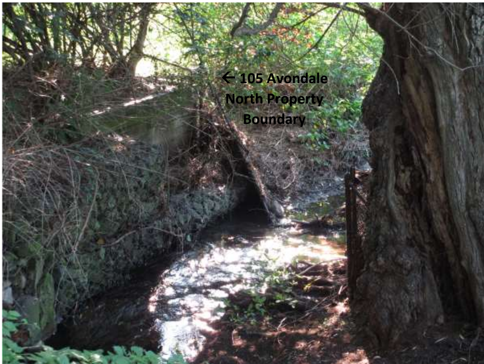
Collapsed Gabion Wall section at 105 Avondale (2014)