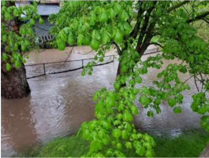
Sat May 25, 2019 6:12pm – 4342 BWP (looking east)