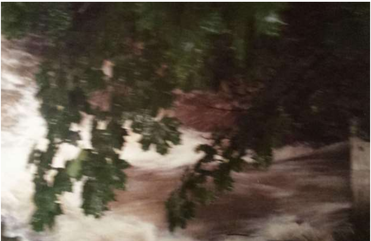
In storm conditions – 105 Laneway Culvert at capacity – South side (exit point)