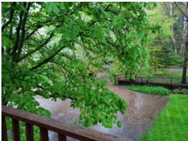
Sat May 25, 2019 6:12pm – 4342 BWP (looking south)