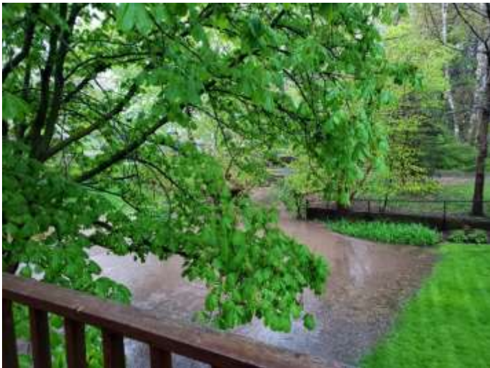
Sat May 25, 2019 6:12pm – 4342 BWP (looking south)