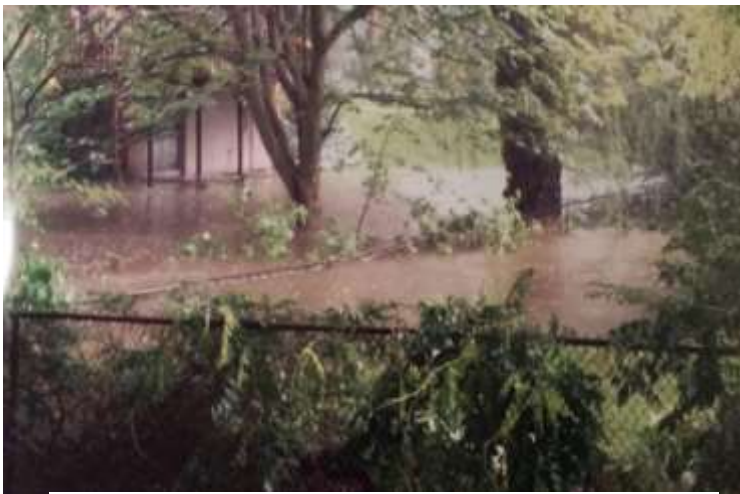
Creek – August 4, 2014 Looking from 105 Culvert toward 4342 BWP