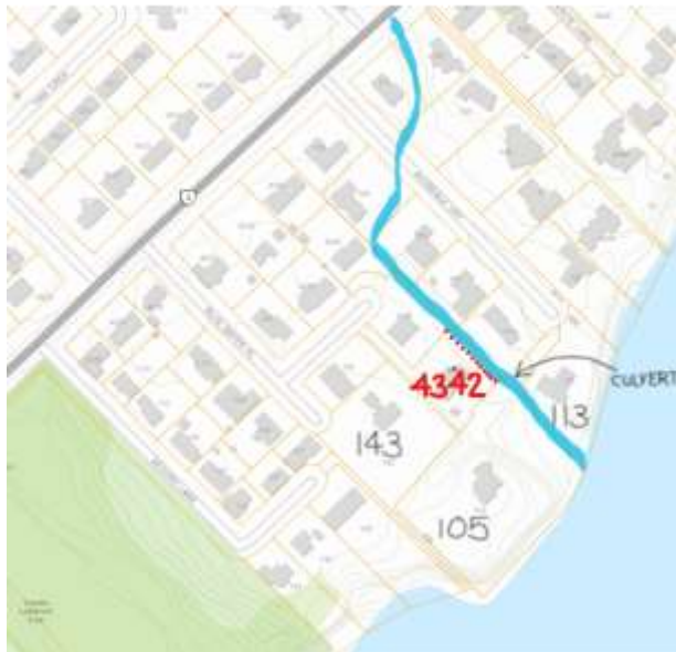
Creek Path – Avondale Court & Blue Water Place

Most recent incident: Saturday May 25, 2019