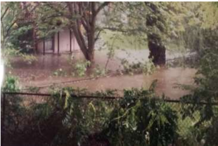
Creek – August 4, 2014 - Burlington Flood [Looking toward 4342 BWP from 105 Culvert]