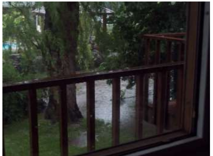
Creek – March 27, 2002