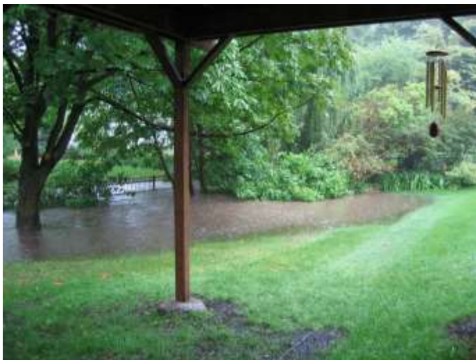
Creek – July 17, 2005