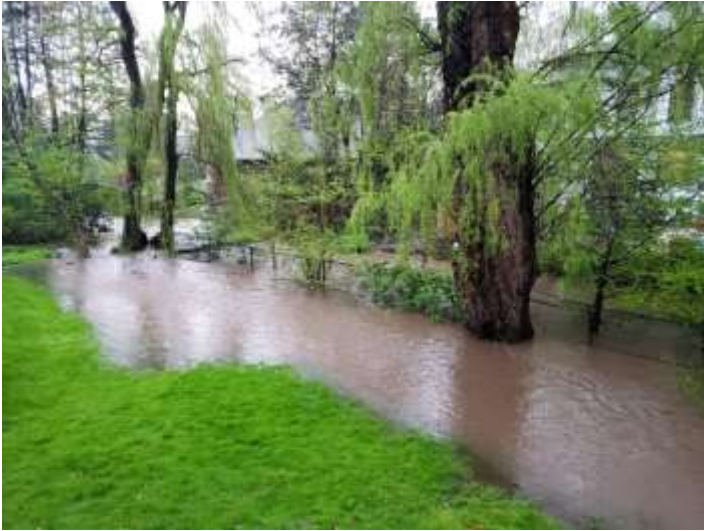
Sat May 25, 2019 6:12pm – 4342 BWP (looking north)