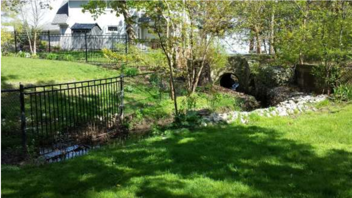
5-Foot High Fence #2 crossing creek at boundary of 136 Avondale & 4342 BWP Culvert underneath 105 Avondale Laneway