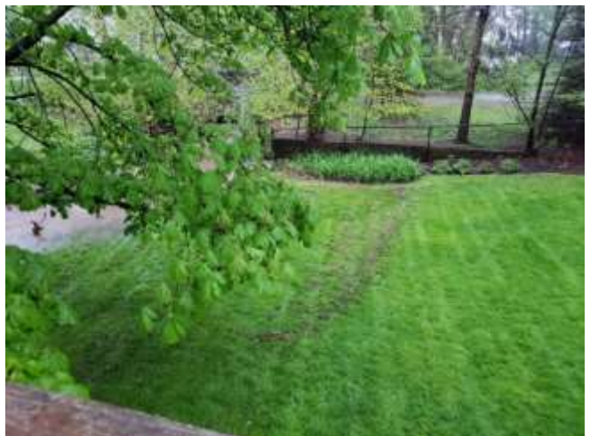
Sat May 25, 2019 6:20pm – Just 8 minutes later