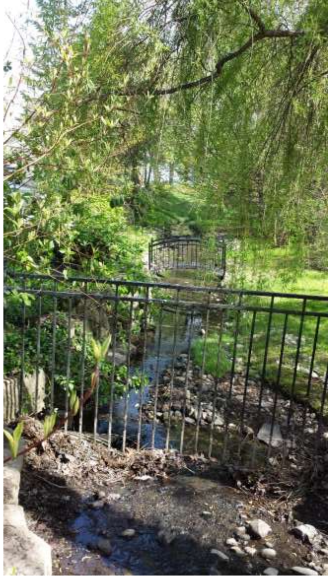
5-Foot high Fence #1 crossing Creek (136 & 146 Avondale boundary facing south)