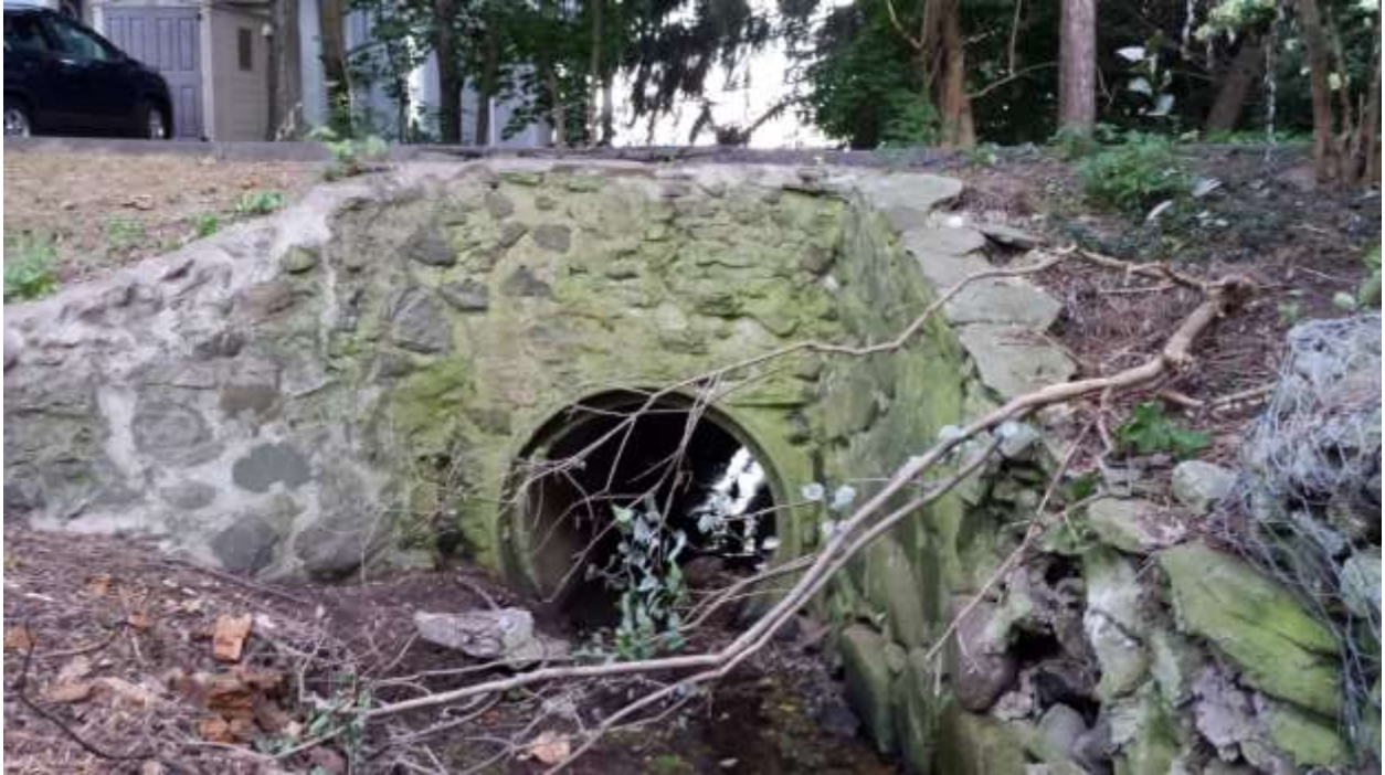
In fair conditions – 105 Laneway Culvert – North side (entry point)