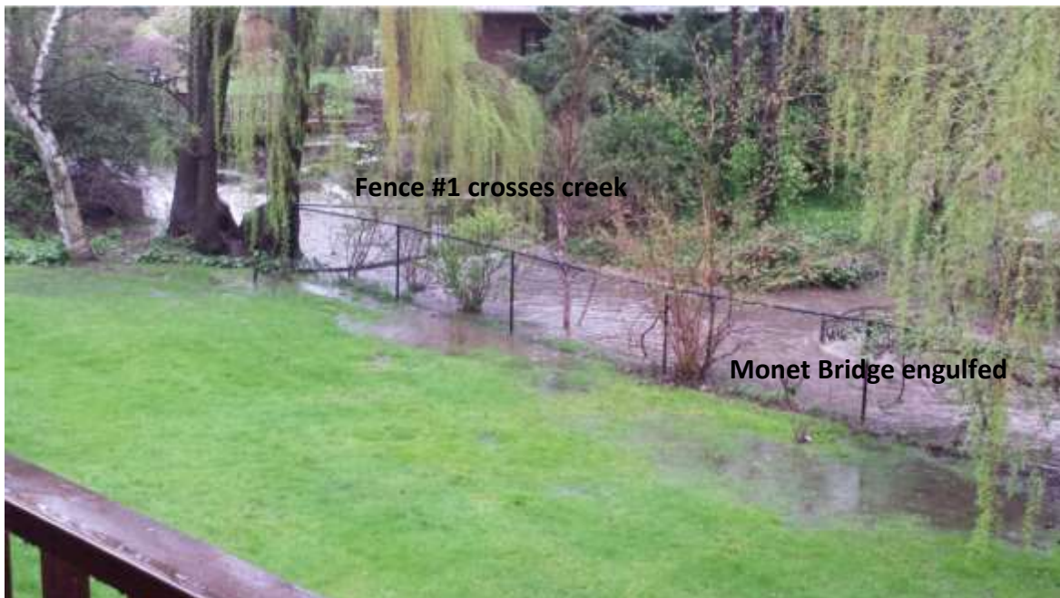
Creek – Monet Bridge in Storm Conditions – May 1, 2017

First of two 5-foot high fences crosses creek between 136 & 146 Avondale