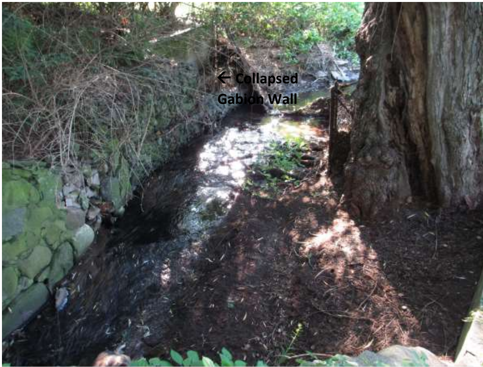
Collapsed Gabion Wall section at 105 Avondale (2014)