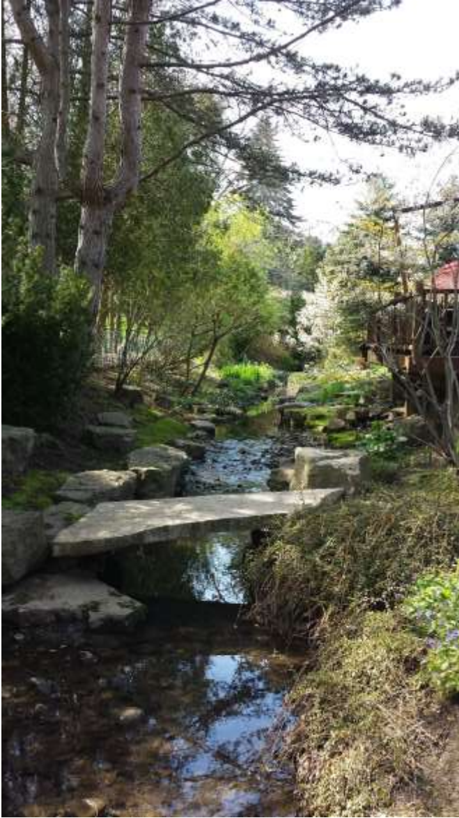
Hardscape (facing north toward 146 Avondale)