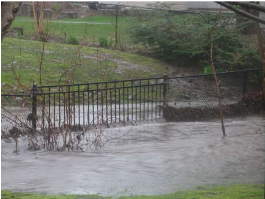
Fence #2 in storm conditions – May 14, 2014 [ 3 months before Burlington Flood on Aug 4, 2014 ]