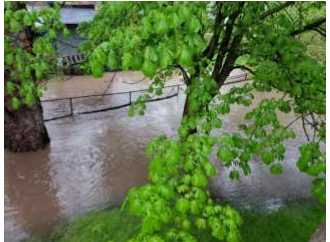
Sat May 25, 2019 6:12pm – 4342 BWP (looking east)