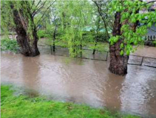
Creek – May 25, 2019