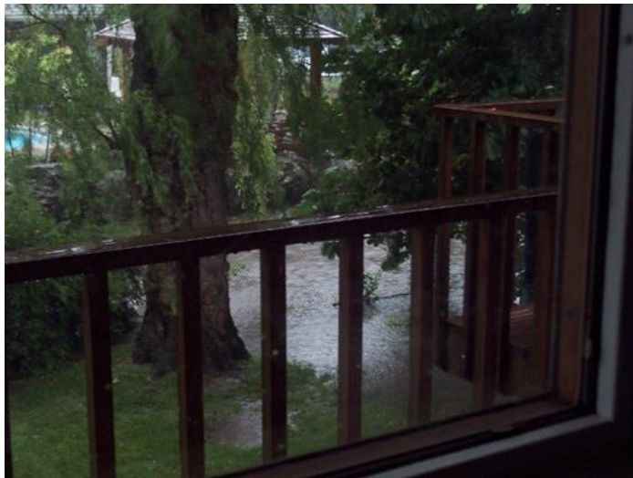
Creek – March 27, 2002