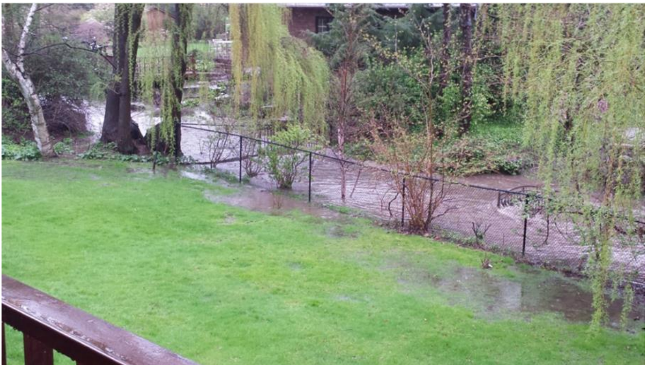
Creek – Monet Bridge engulfed – May 1, 2017