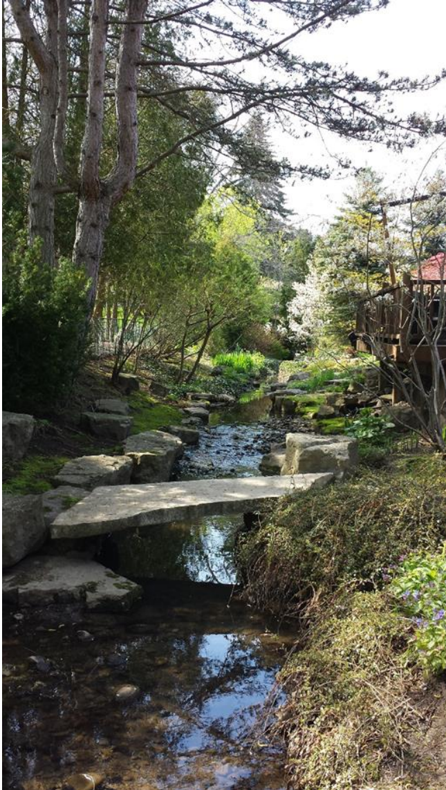
Creek facing north