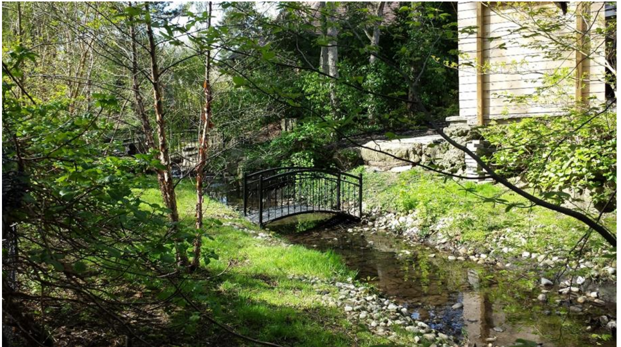
Creek – Monet Bridge on a Fair Day (136 Avondale)

Creek – Regulation and Maintenance Required