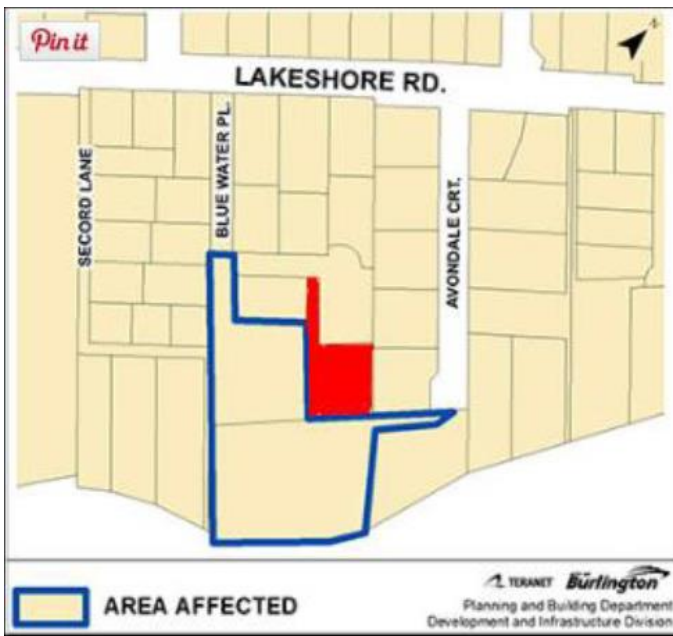
Site at 105 Avondale Court & 143 Blue Water Place (4342 Blue Water Place shown in red)

Most recent incident: Saturday May 25, 2019