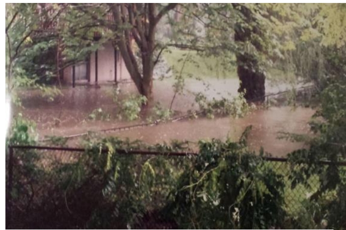
Creek – August 4, 2014 Looking from 105 Culvert toward 4342 BWP