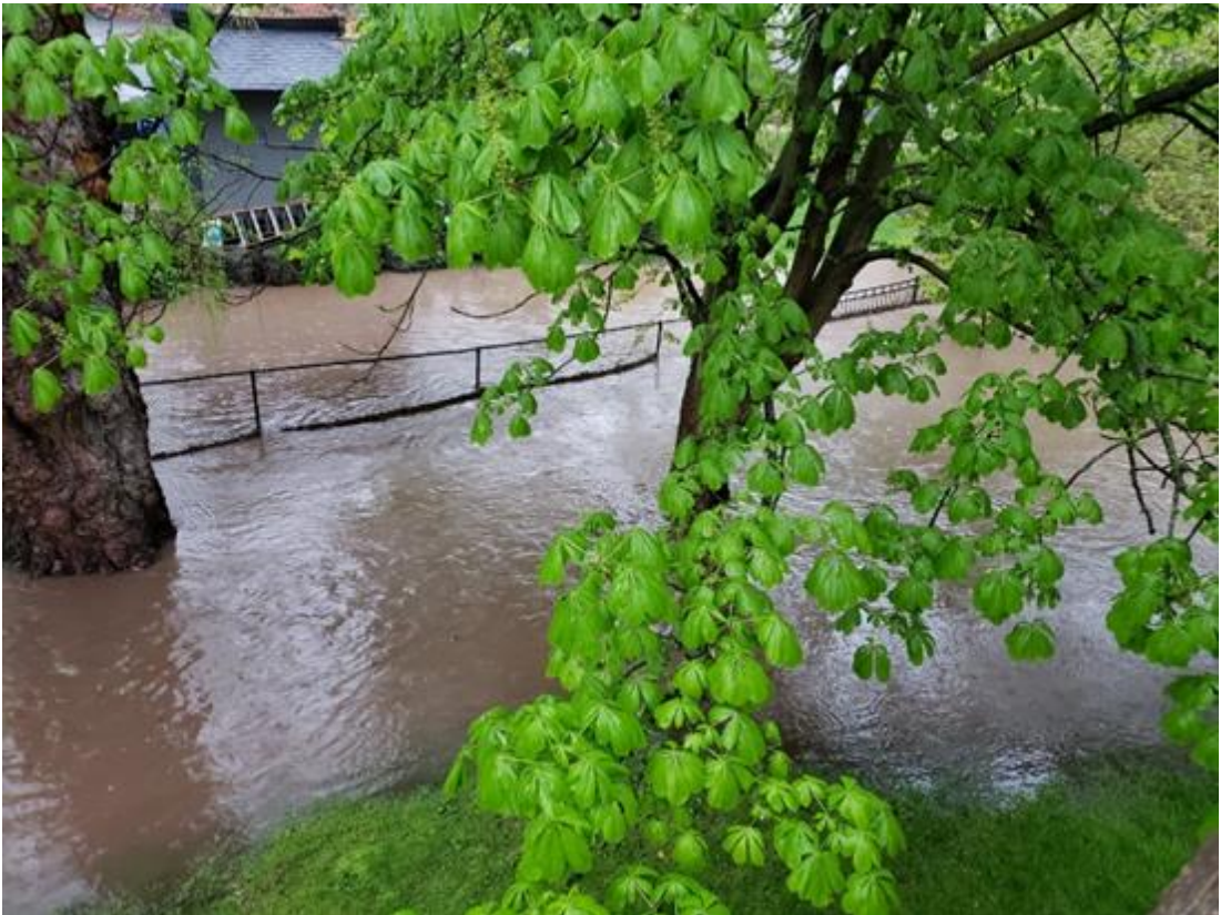
Sat May 25, 2019 6:12pm – 4342 BWP (looking east)