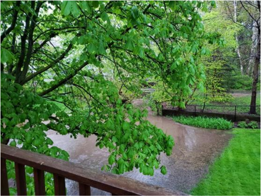
Sat May 25, 2019 6:12pm – 4342 BWP (looking south)