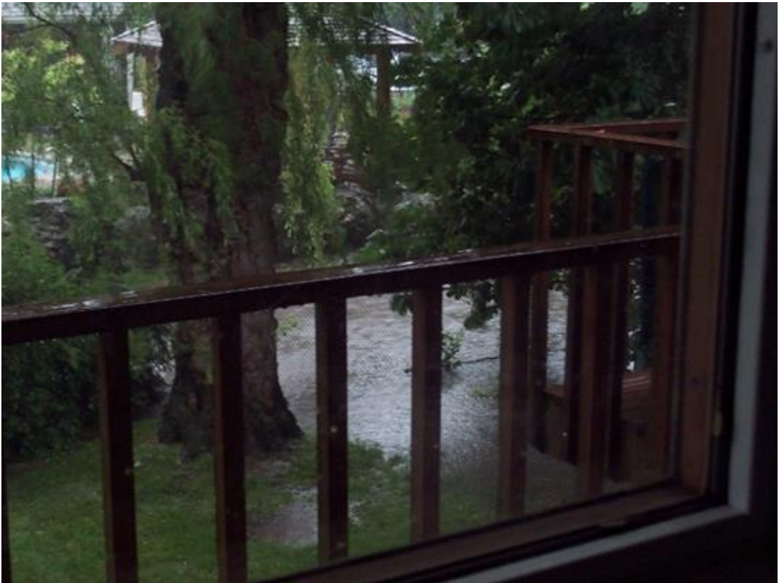
Creek – March 27, 2002