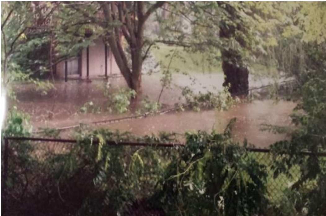
Creek – August 4, 2014 Looking from 105 Culvert toward 4342 BWP