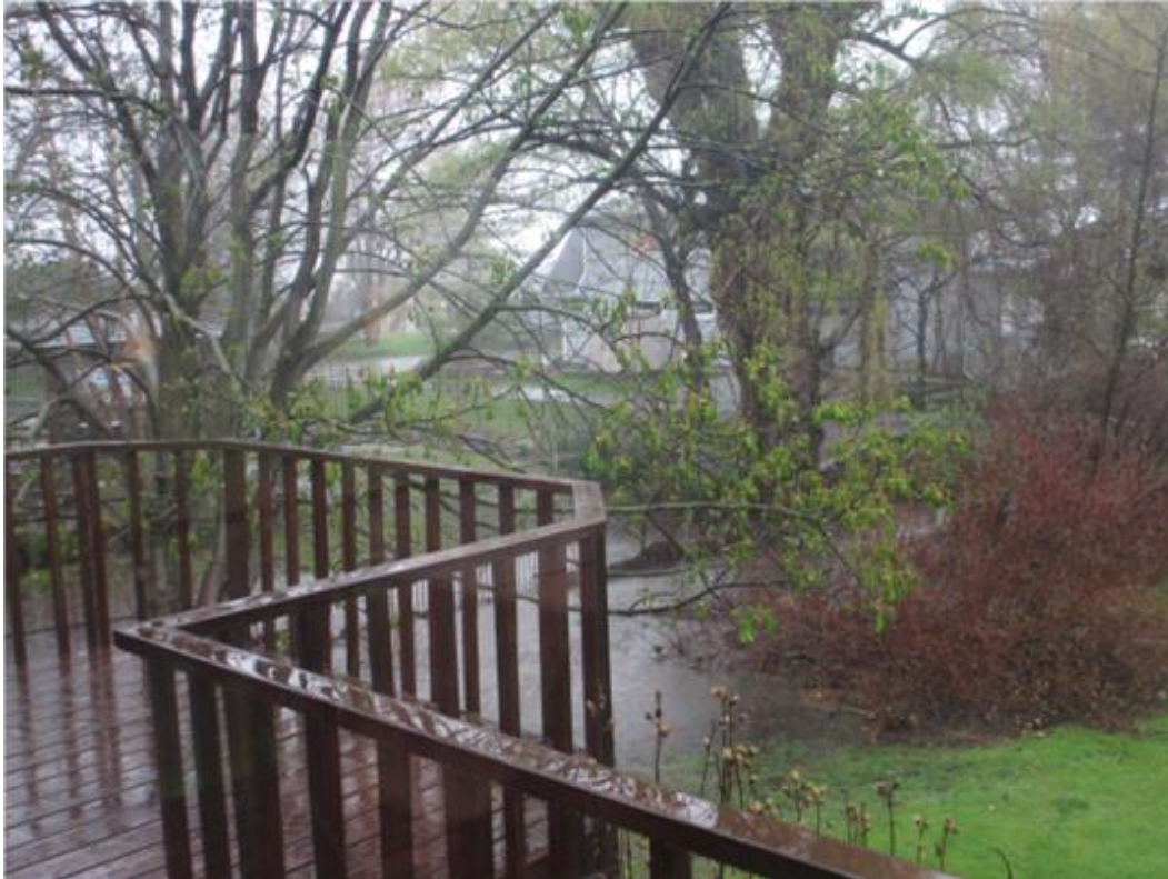
Creek – May 14, 2014