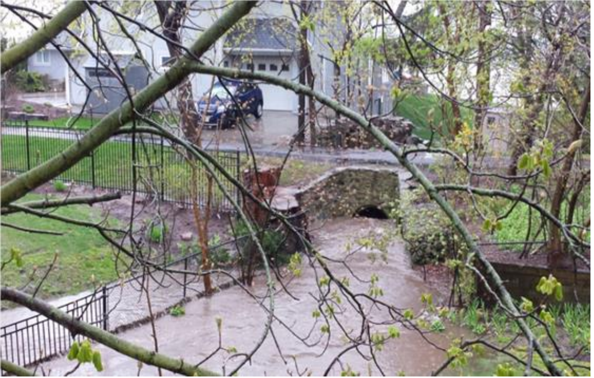
Creek – May 1, 2017