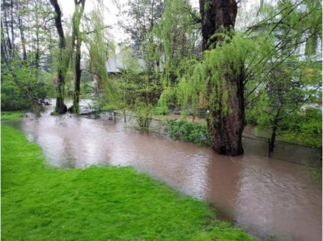
Sat May 25, 2019 6:12pm – 4342 BWP (looking north)