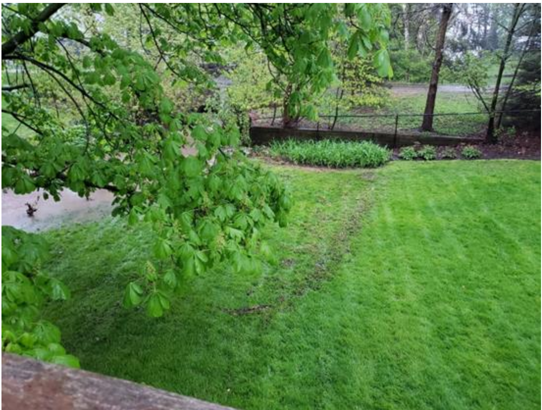
Sat May 25, 2019 6:20pm – 4342 BWP (looking south)

Just 8 minutes later. Shows peak water level debris.