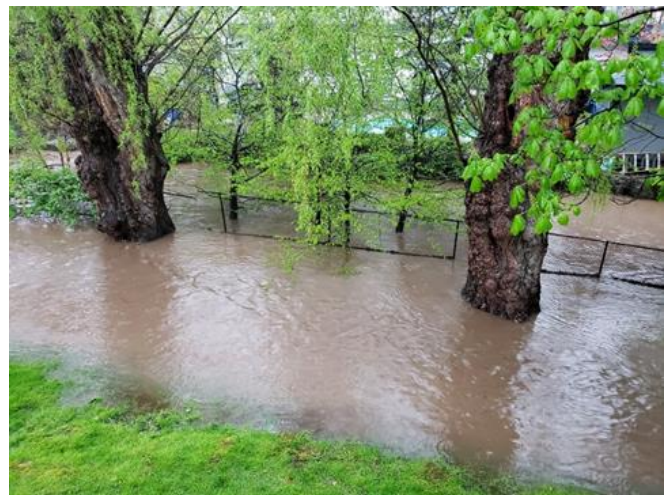
Creek – May 25, 2019