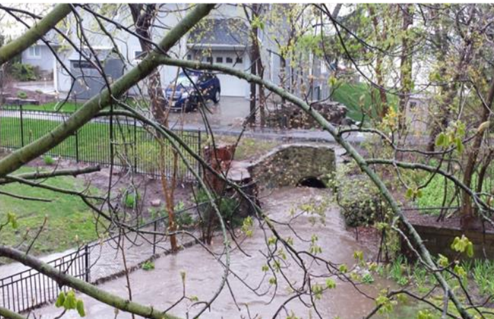
Creek – May 1, 2017