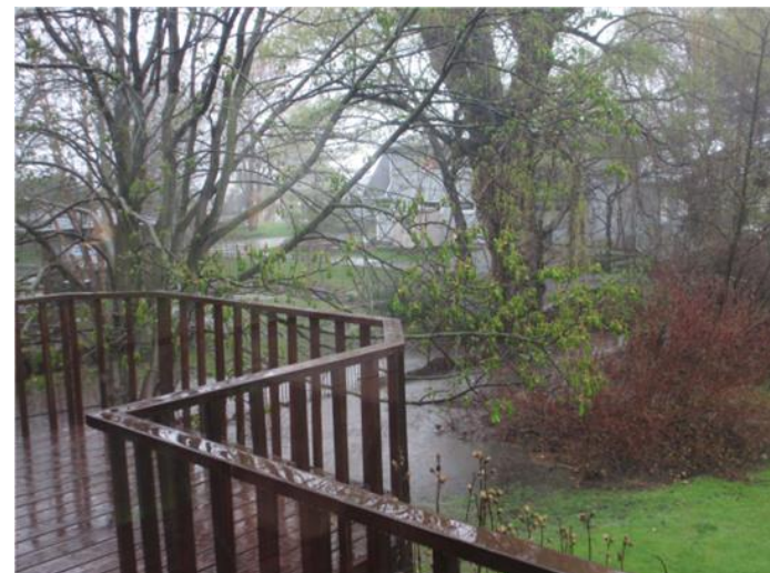
Creek – May 14, 2014