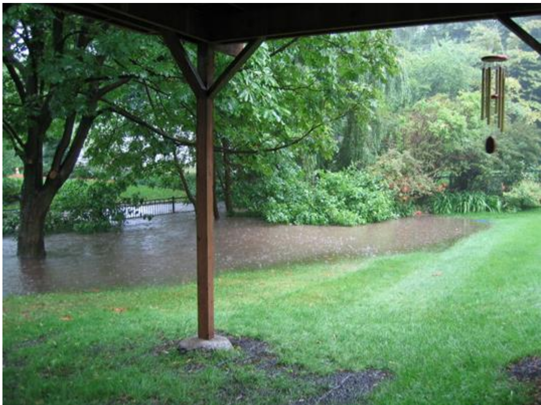
Creek – July 17, 2005