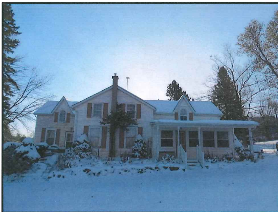
Image 10: West Elevation of the Farmhouse (Photo taken on November 13, 2019; Facing East)