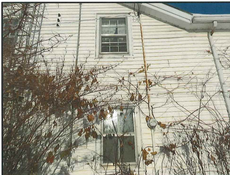
Image 6: Detail of the Farmhouse Windows (Photo taken on November 13, 2019; Facing West)