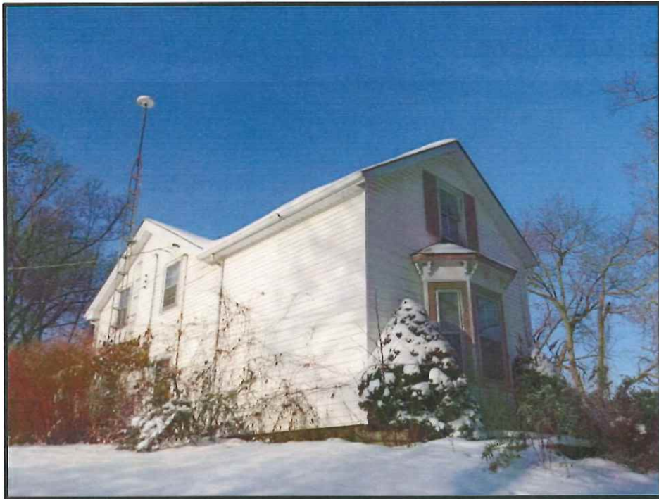
Image 3: Northeast Corner of Farmhouse (Photo taken on November 13, 2019; Facing Southwest)