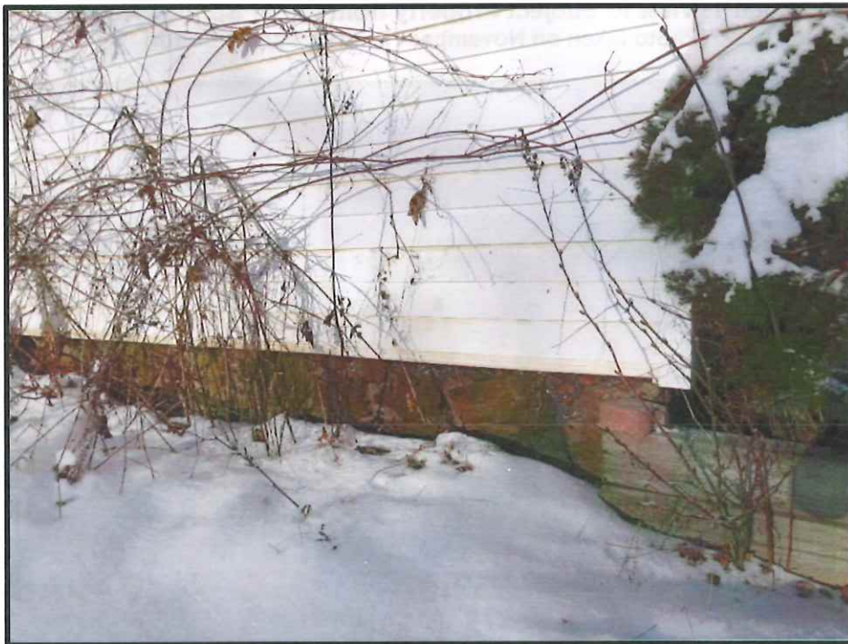
Image 4: Detail of Farmhouse Stone Foundation (Photo taken on November 13, 2019; Facing Southwest)