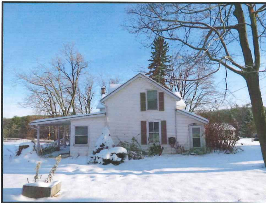
Image 8: South Elevation of the Farmhouse (Photo taken on November 13, 2019; Facing North)