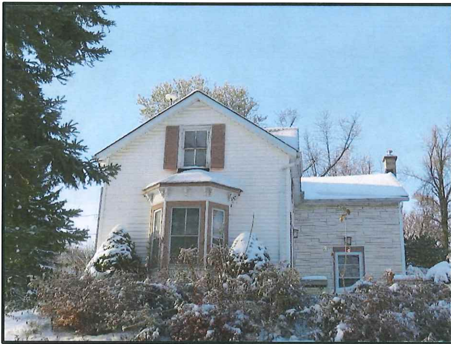
Image 2: Farmhouse Façade, 5780 Cedar Spring Road, Burlington (Photo taken on November 13, 2019; Facing South)