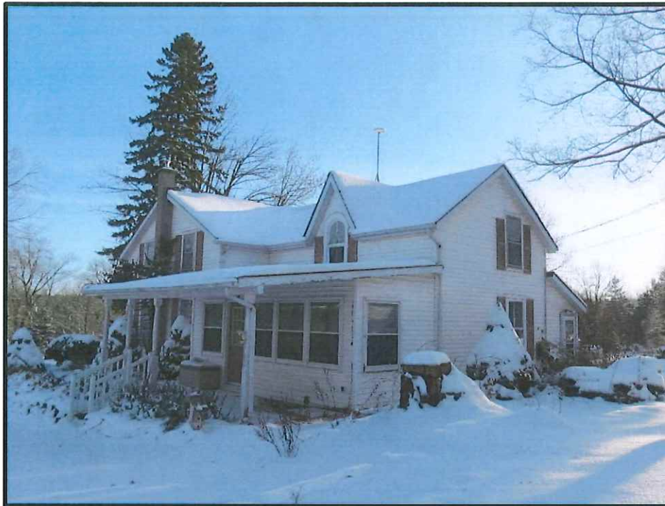
Image 9: Southwest Corner of the Farmhouse (Photo taken on November 13, 2019; Facing Northeast)