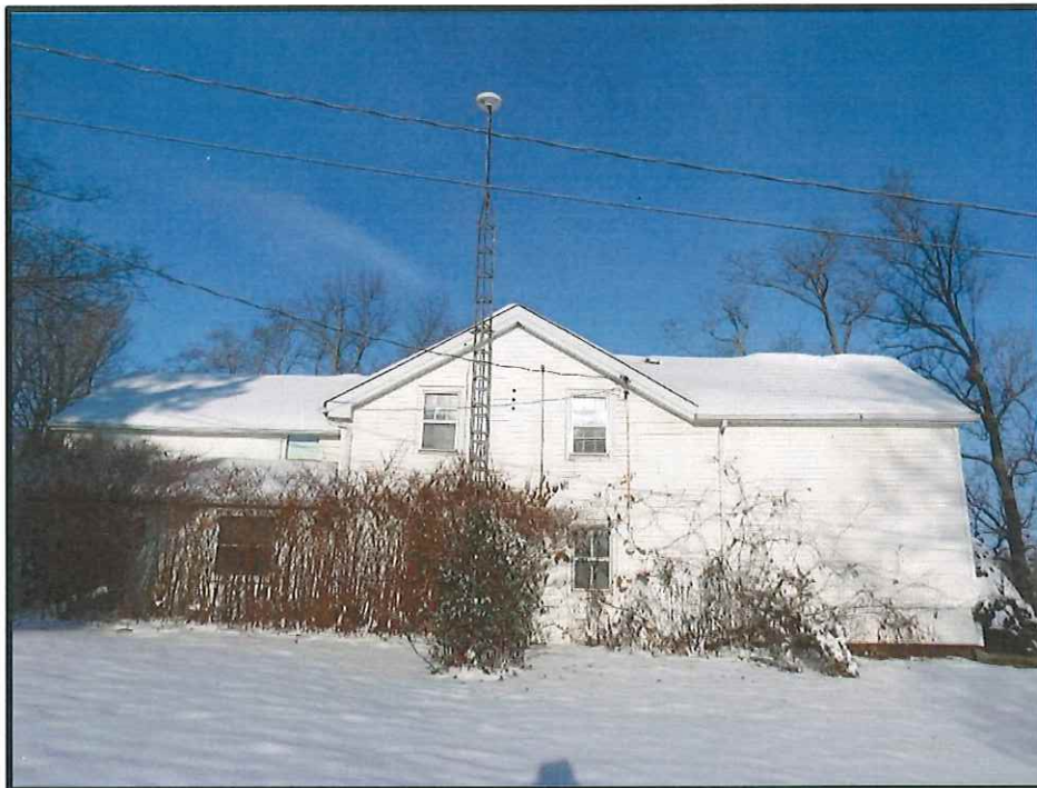
Image 5: East Elevation of the Farmhouse (Photo taken on November 13, 2019; Facing West)