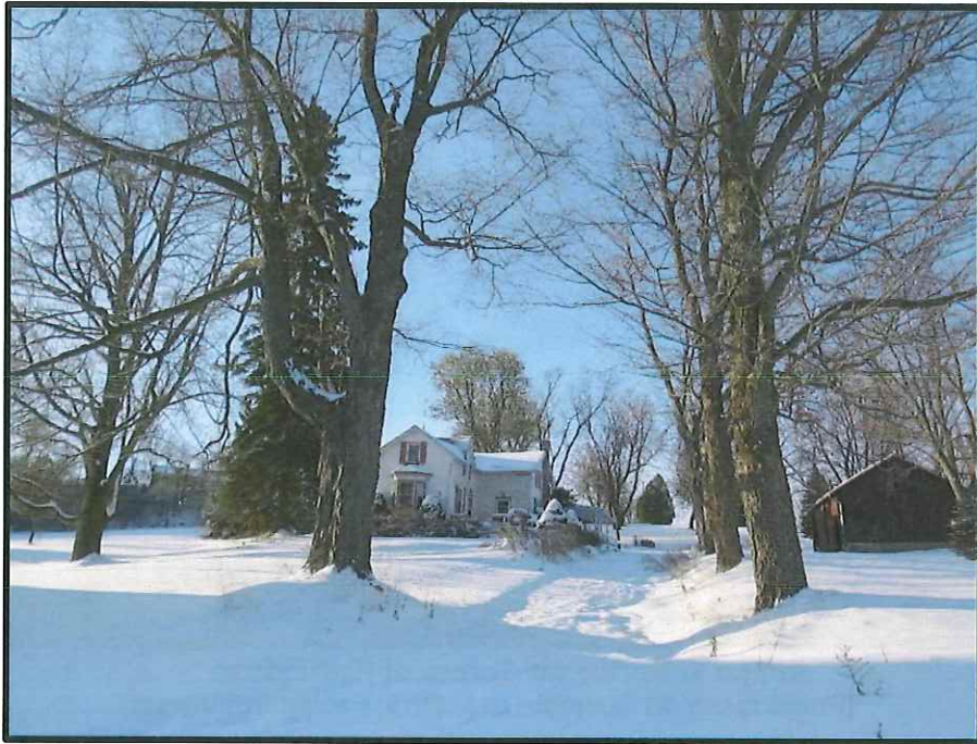
Image 1: View to Subject Property from Cedar Springs Road (Photo taken on November 13, 2019; Facing South)