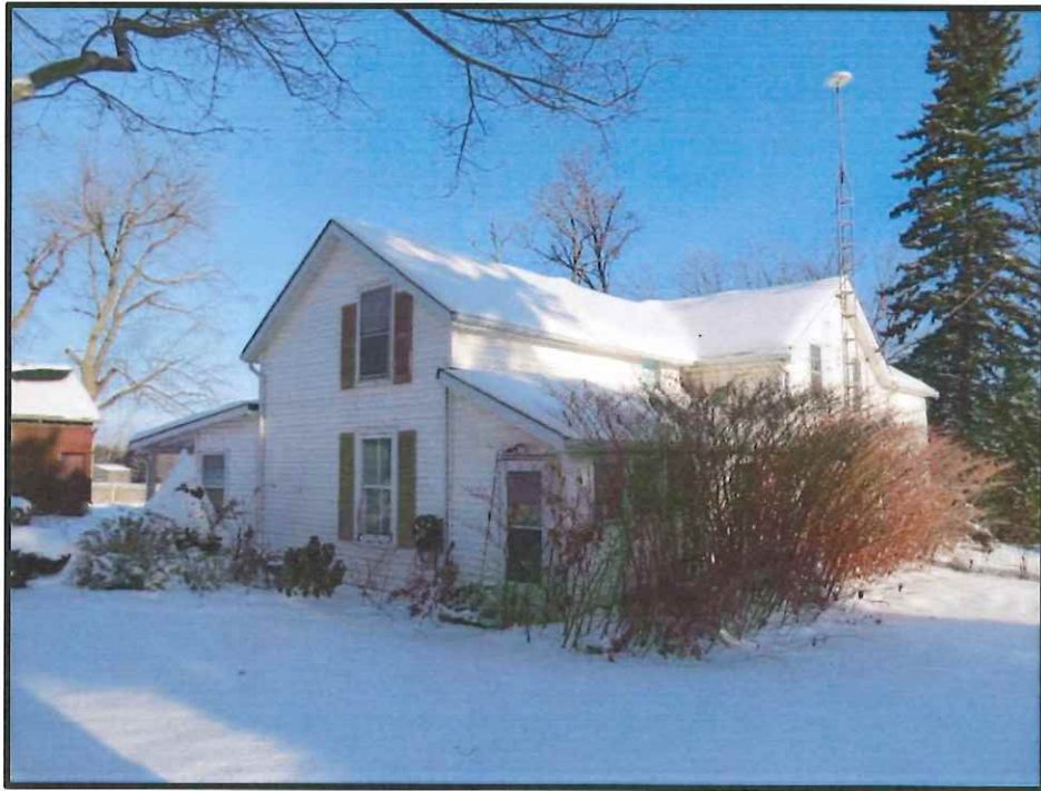
Image 7: Southeast Corner of the Farmhouse (Photo taken on November 13, 2019; Facing Northwest)