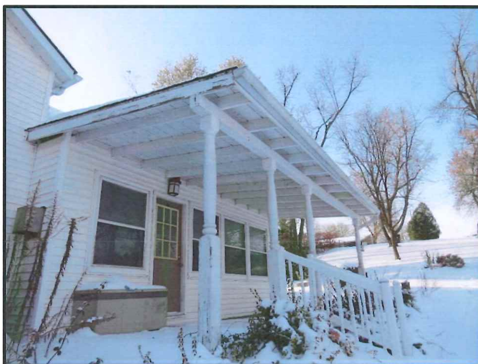
Image 12: Detail of Porch leading to South Addition to Farmhouse (Photo taken on November 13, 2019; Facing West)