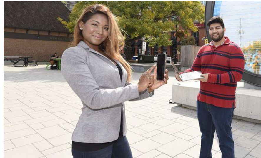
Digital Service Squad featured on the front page of the Burlington Post, and more than 60 businesses receiving support to date.