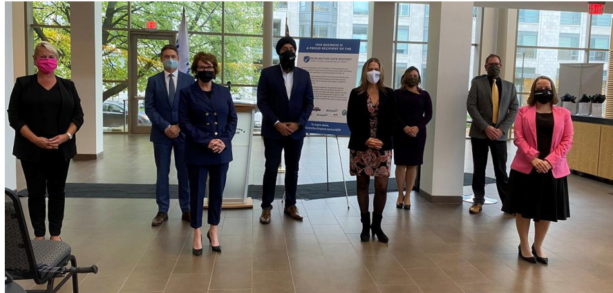
Safe Restart Funding Announcement with the Hon. Prabmeet Singh Sarkaria, Ontario's Minister of Small Business and Red Tape Reduction. Almost $125k across 59 businesses. Round 2 in progress.