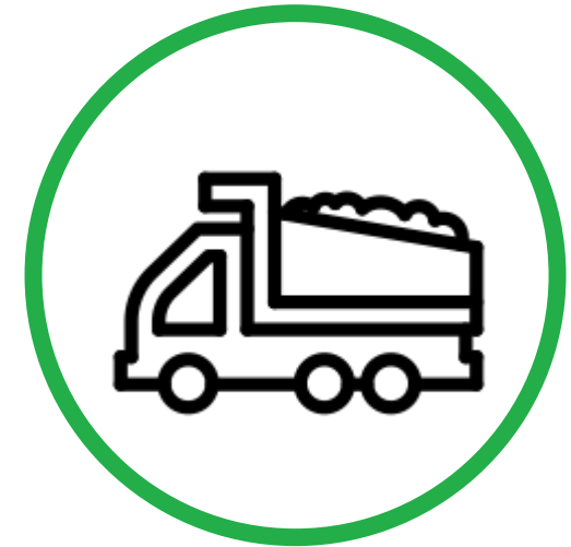
Quarries and Air Quality