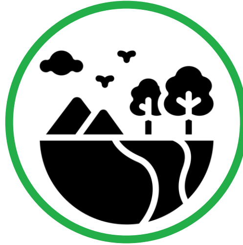
Keep Conservation Authorities intact