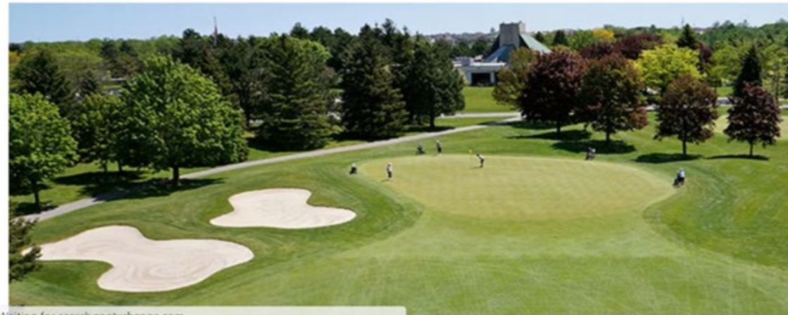
Waiting for coarb centerhanna.com