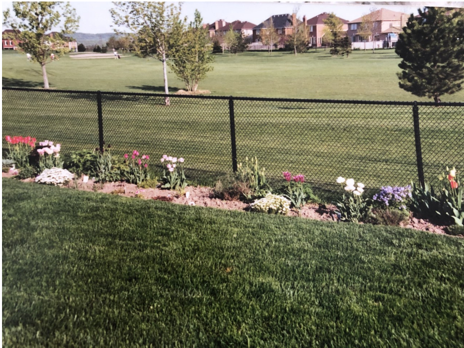
Trees on golf course in 1990

Results obtained from analysis using Itree Eco v6