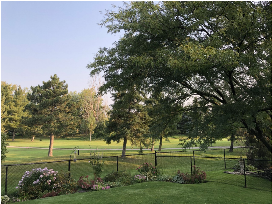
Trees on golf course in 2020