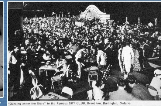
Dancing under the stars at the famous SKY CLUB, Brant Inn, Burlington, Ontario