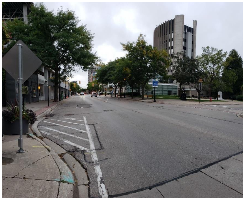
Figure 7: Brant Street looking south