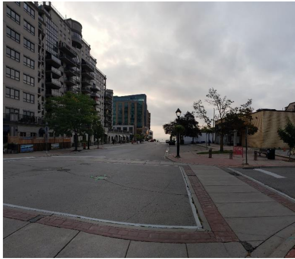
Figure 4: Intersection of Elizabeth and Pine St, looking south to Lakeshore

The following issues were noted which resulted in the elimination of lower Elizabeth St: