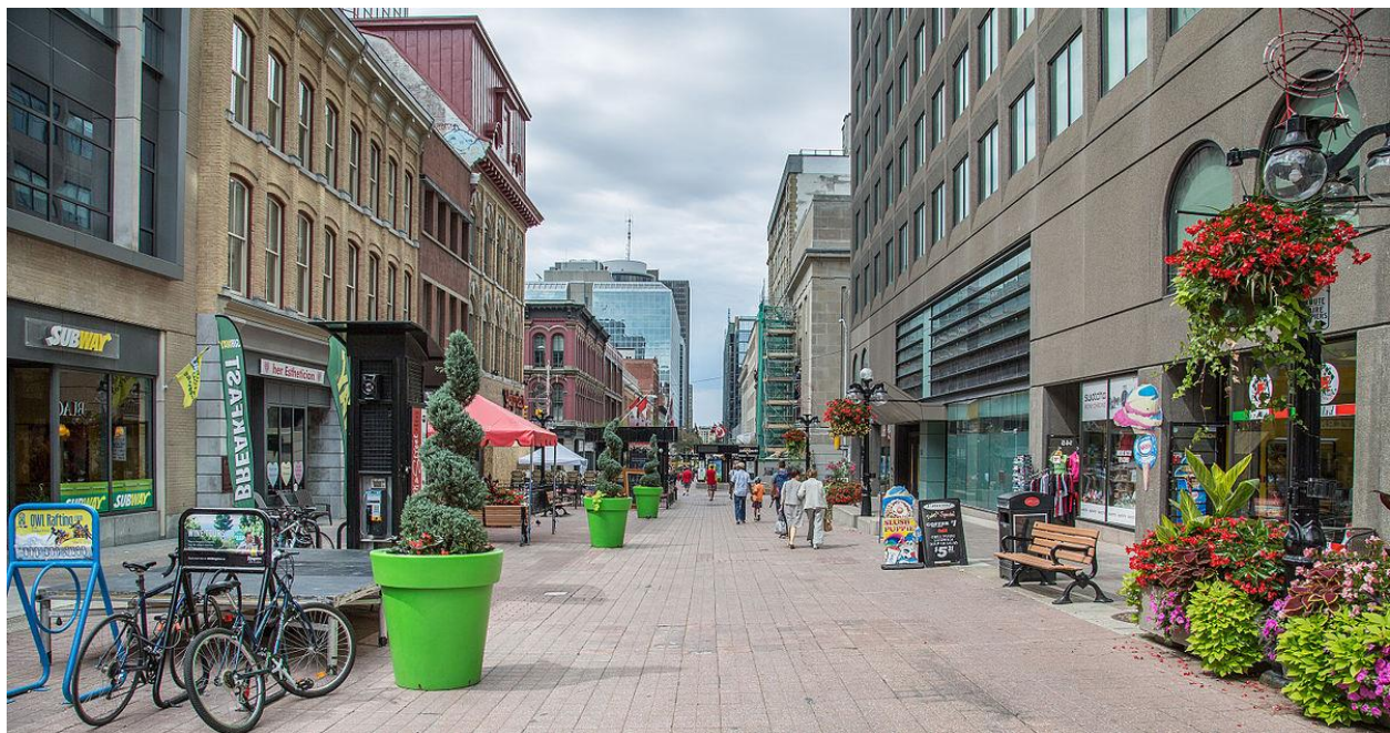
Figure 2: Sparks Street/Rue Sparks in Ottawa, Ontario

In 1967, Ottawa looked to Sparks Street, a former main street in Ottawa, home to various historical figures and a commercial destination to become their first PP. Initially only pedestrianized in the summer, the city converted it into a permanent pedestrian precinct thereby establishing it as Canada's first outdoor pedestrian mall post-industrialization. More recently, areas with significant