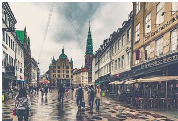
Figure 1: (Left) Stroget Street in 1935, pre-pedestrianization; (Right) Present-day Stroget Street post-pedestrianization

In October of 1962, a two year pilot project began on Stroget Street to pedestrianize the area to improve the flow of people as the sidewalks were becoming too crowded. This came with fears