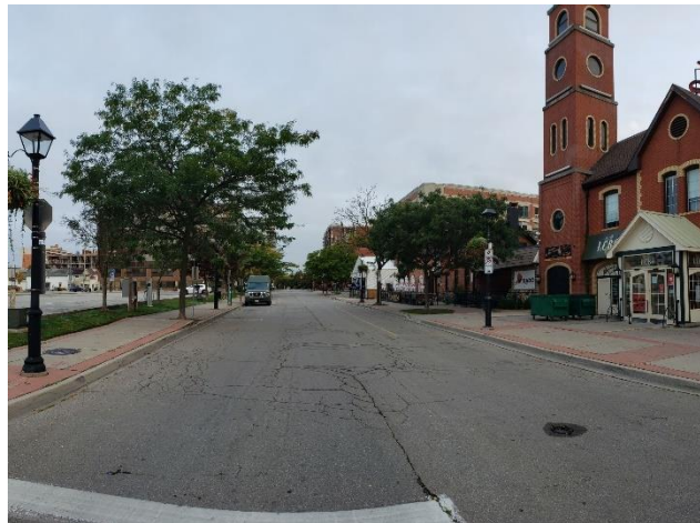
Figure 5: Intersection of Elizabeth and Pine St, looking north to James St

The following issues were noted which resulted in the elimination of upper Elizabeth St: