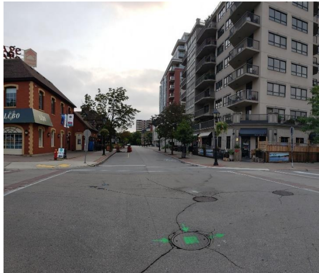
Figure 6: Intersection of Elizabeth and Pine St, looking east to Pearl Street

The following issues were noted which resulted in the elimination of upper Pine St: