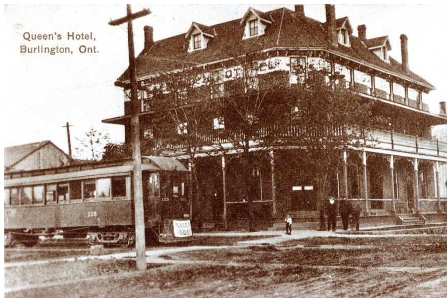
Figure 8: Queens Hotel (now The Queens Head restaurant) in downtown Burlington