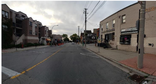
Figure 3: John St, South of Pine looking south

The following issues were noted which resulted in the elimination of lower John St: