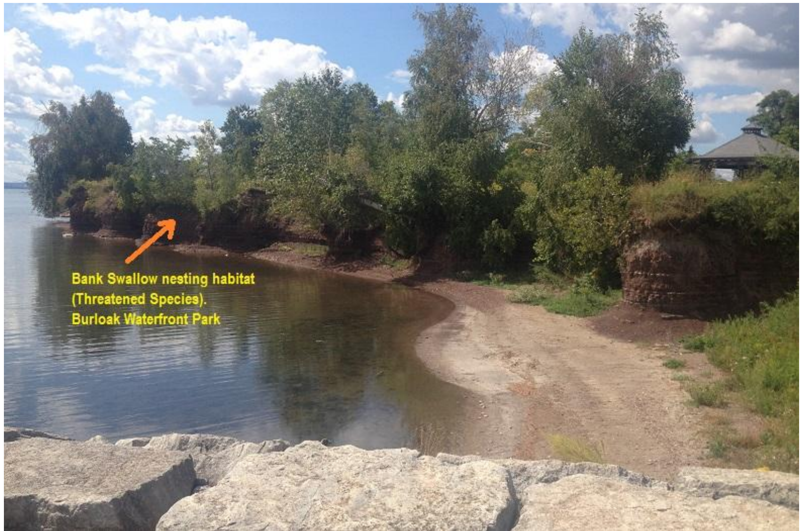
Bank Swallow nesting habitat (Threatened Species). Burloak Waterfront Park