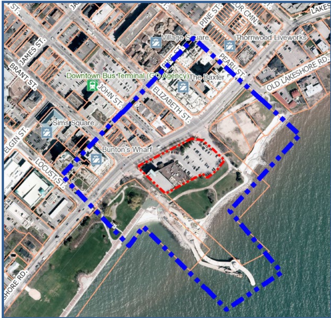
Figure 1 – Brant & Lakeshore Planning Study Area