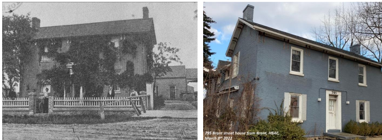
The Jabez Bent House in 1902 (left) and today (right)

Appendix B- Heritage Evaluation to Add Properties of Interest to the Registry- 795 Brant Street, Heritage Burlington Committee, 2022).