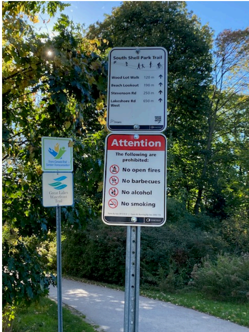
FIGURE 4 – NO COYOTE SIGNS WHATSOEVER AT THE BLUEWATER CONDO TRAILS ENTRANCE, WEST OAKVILLE. THIS TRAIL IS HEAVILY VISITED BY COYOTES.