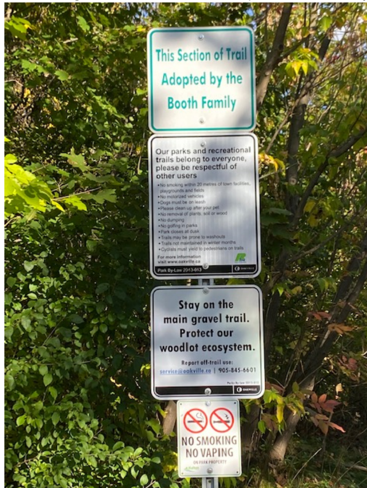
FIGURE 1 – SIGN AT ENTRANCE TO SHELDON CREEK TRAIL, THE SITE OF SEVERAL COYOTE ATTACKS. THIS IS A HEAVILY UTILIZED TRAIL AND CHILDREN’S PLAYGROUND IMMEDIATELY NEXT TO TRAIL ENTRANCE. COYOTES KNOWN TO USSE THIS ENTRANCE TO LEAVE THE TRAIL SYSTEM AS THEY MAKE THEIR WAY TO THE LAKE VIA WILMOT ROAD AND STEVENSON ROAD.

Signage is very specific on dogs on leash, no vaping and staying on the trail, but there are limited warnings to residents about the prevalence of coyotes.