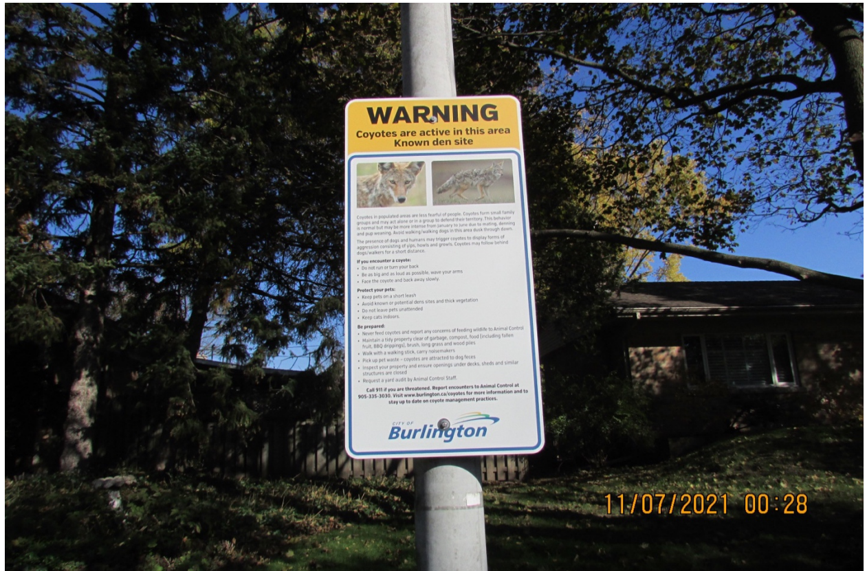
FIGURE 9 - COYOTE WARNING SIGN POSTED ON GOODRAM AVENUE IN BURLINGTON, A NEIGHBOURHOOD THAT HAS EXPERIENCE MANY COYOTE SIGHTINGS. THIS SHOULD BE THE TEMPLATE FOR ALL SIGNS ACROSS OAKVILLE AND BURLINGTON IN COYOTE “HOT SPOTS”.