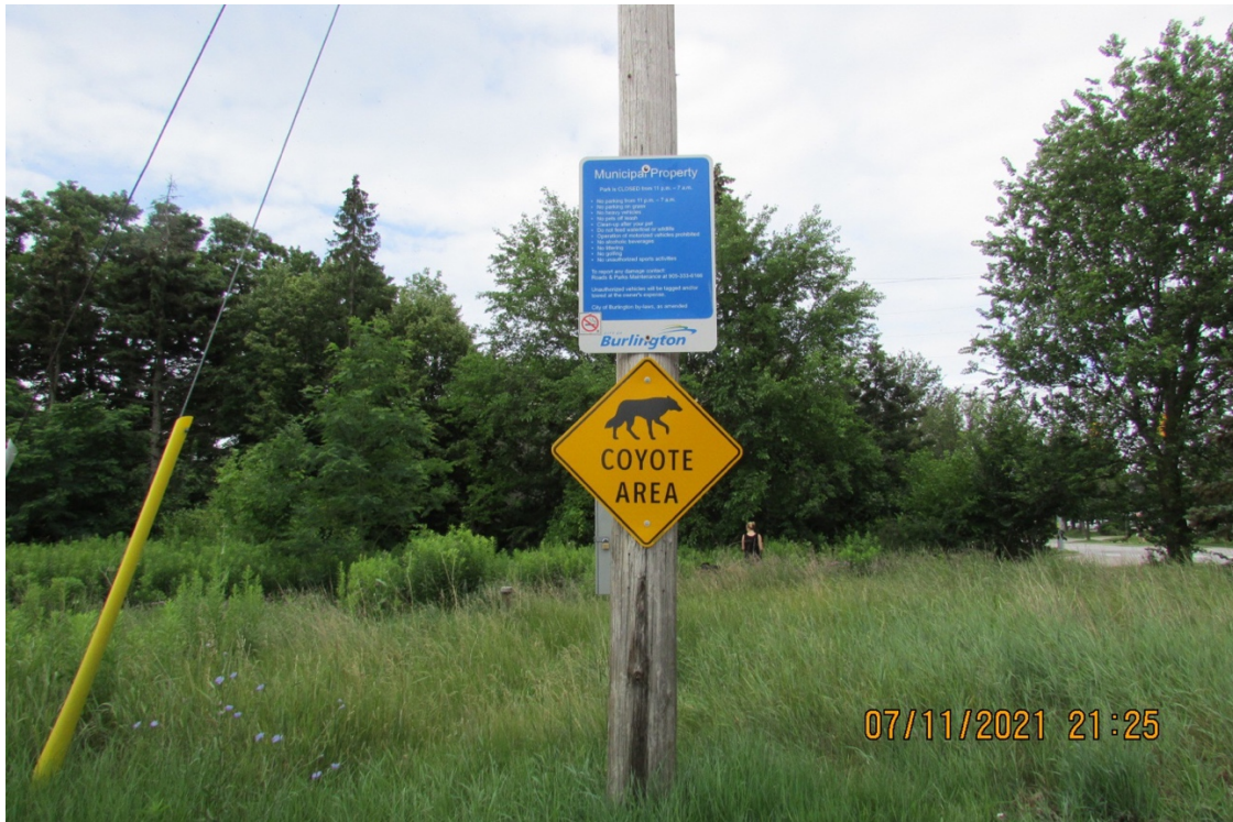
FIGURE 5 – BURLOAK WATERFRONT PARK - WEST PARKING LOT. THERE ARE 3 PARKING LOTS, 2 WALKWAY ENTRANCES, AND ONLY 1 COYOTE WARNING SIGN. THIS PARK IS FULL OF COYOTES AT DAWN AND DUSK. THERE ARE ABSOLUTELY NO WARNING SIGNS ABOUT COYOTES.