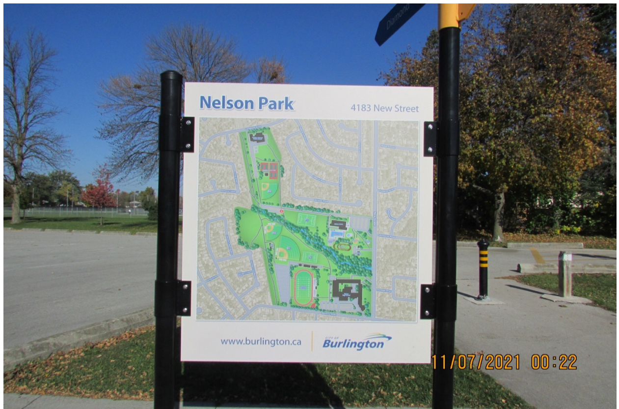
FIGURE 7- ENTRANCE TO NELSON PARK IN BURLINGTON. COYOTES HAVE FREQUENTLY BEEN SIGHTED IN THIS PARK AND A THE NEARBY PAULINE JOHNSON PUBLIC SCHOOL. NO MENTION OF COYOTES.