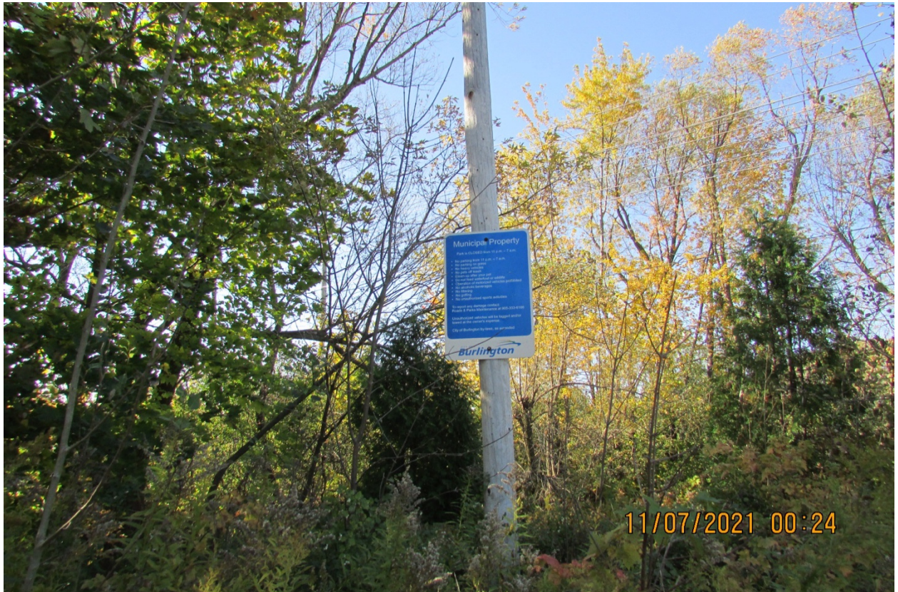
FIGURE 8 - SIGN AT PARKING LOT IN NELSON PARK. THIS SIGN IS SITUATED TOO HIGH. AGAIN, NO MENTION OF COYOTES.