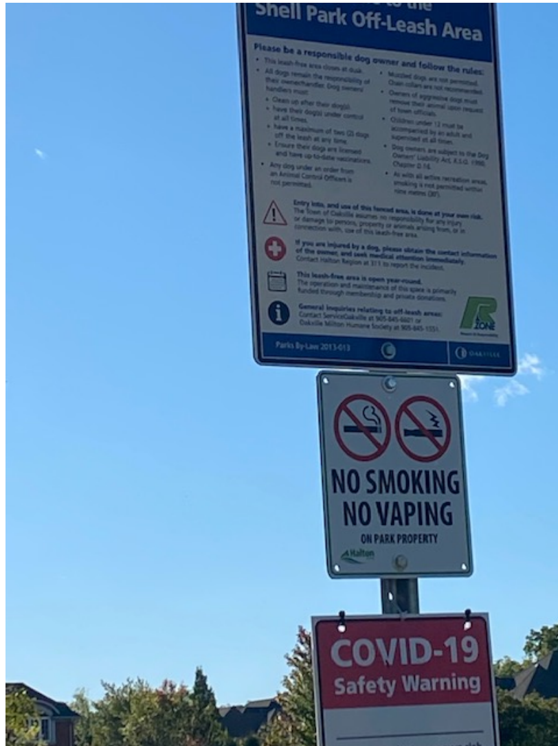
FIGURE 2 – SIGN AT ENTRANCE TO SHELL DOG PARK, WEST OAKVILLE. THERE ARE ABSOLUTELY NO SIGNS IN SHELL PARK WHERE COYOTES AND DENS ARE PREVALENT AND KNOWN TO EXIST. AGAIN, THERE ARE MANY RULES BUT NO COYOTE WARNINGS.