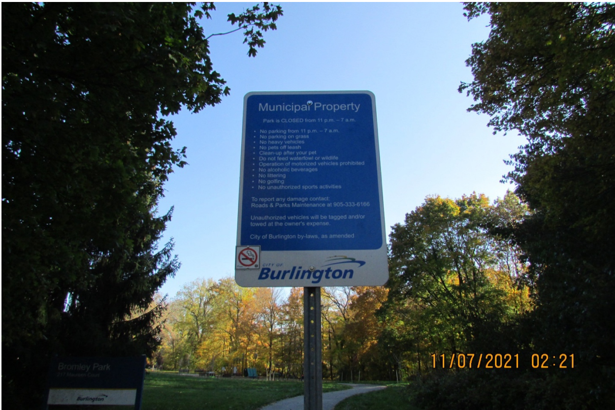
FIGURE 10 - ENTRANCE TO BROMLEY PARK IN BURLINGTON OFF OF MAUREEN COURT. NO MENTION OF COYOTES.