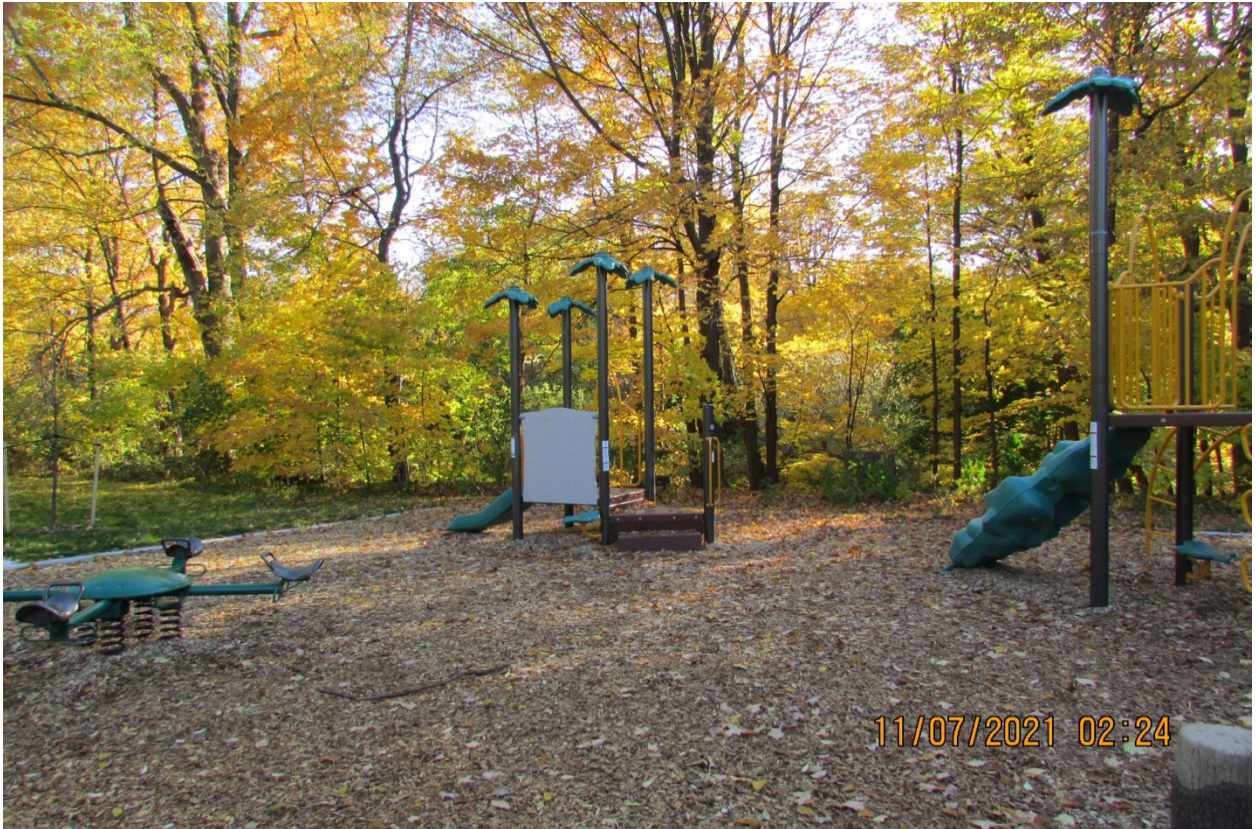
FIGURE 11 - THIS IS THE PLAYGROUND AT BROMLEY PARK IN BURLINGTON. THE AREA BEHIND IS A RAVINE AND A KNOWN HABITAT FOR COYOTES WHICH ARE PREVALENT IN THE AREA. THERE IS NO MENTION OF COYOTES. RECENT UPGRADES TO THIS PARK DIDN'T INCLUDE BETTER SIGNAGE.