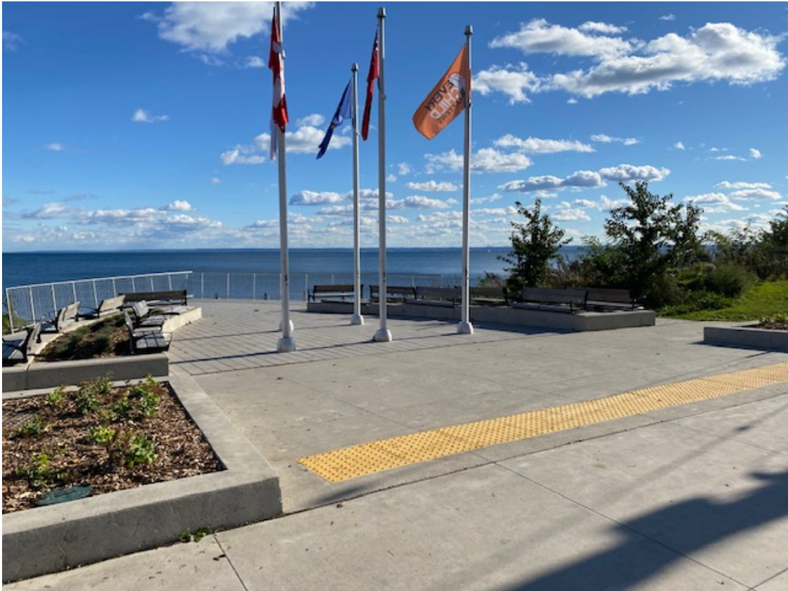
FIGURE 6 – NO COYOTE SIGNS WHATSOEVER AT THE ENTRANCE TO THE BURLOAK WATERFRONT PARK (OAKVILLE SIDE)