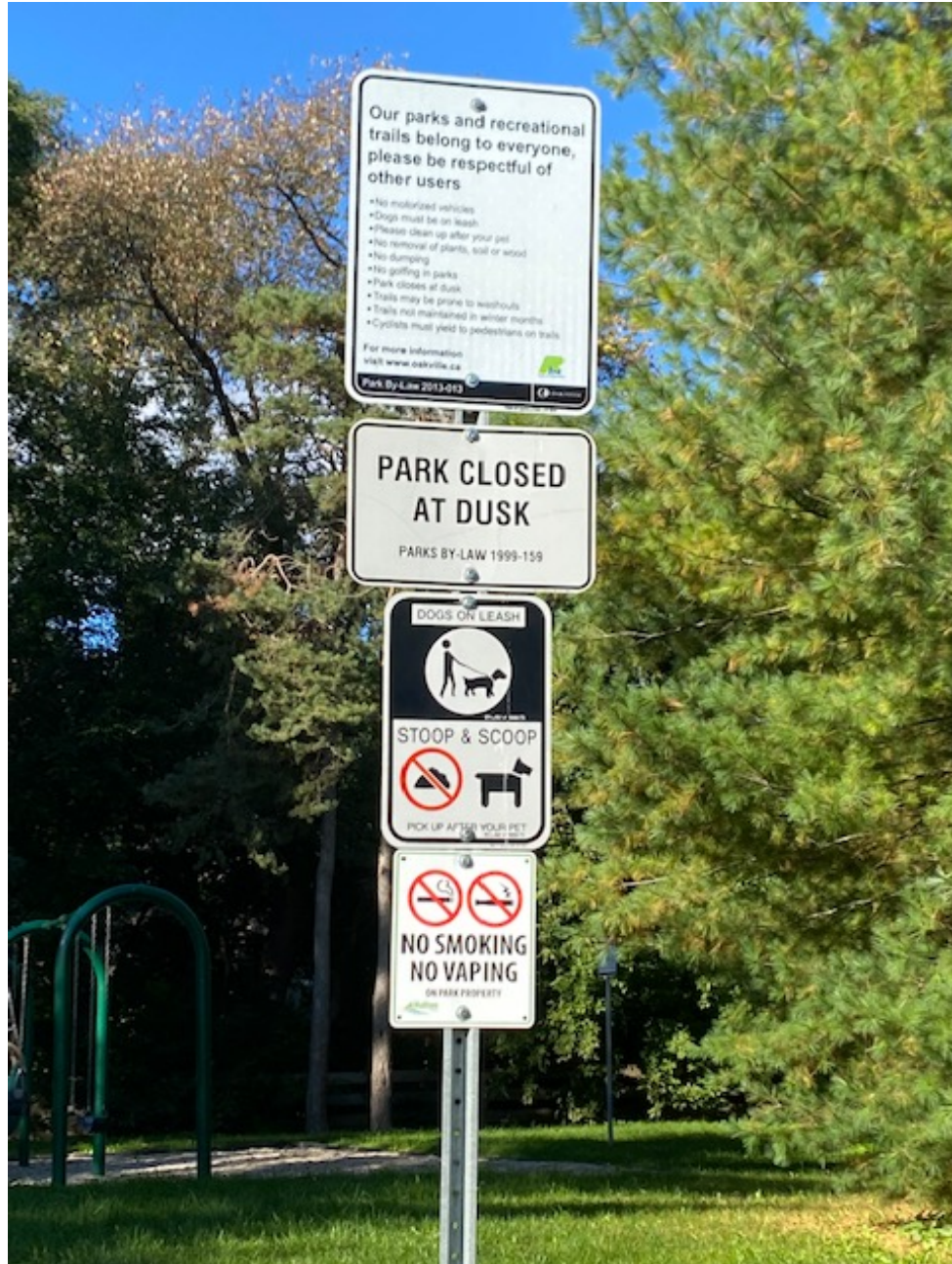
FIGURE 3 - SIGN AT ENTRANCE TO SOUTH SHELL BEACH PARK, WEST OAKVILLE. AGAIN, THERE ARE MANY RULES BUT NO COYOTE WARNINGS.