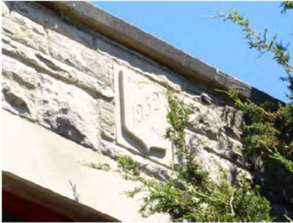
1932 DATE STONE – INITIALS MAY IDENTIFY THE ARCHITECT & BUILDER?