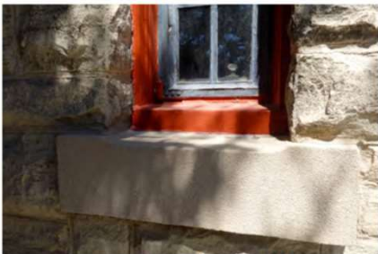
CAST STONE SILLS & METAL CASEMENT WINDOWS WITH WOOD FRAMES WOOD DETAIL ON SIDE PORCH