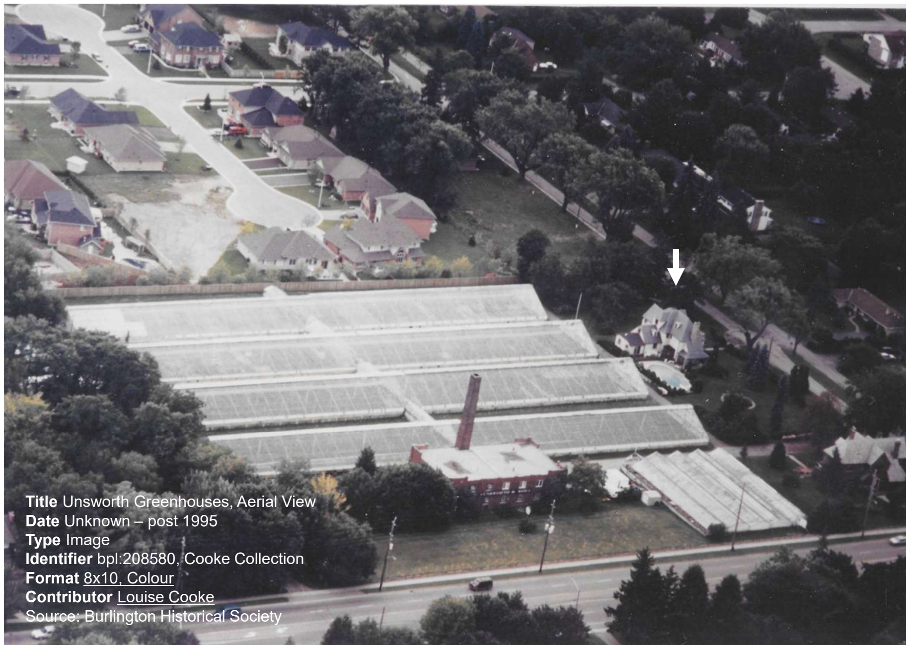
Title Unsworth Greenhouses, Aerial View Date Unknown – post 1995 Type Image Identifier bpl:208580, Cooke Collection Format 8x10, Colour Contributor Louise Cooke