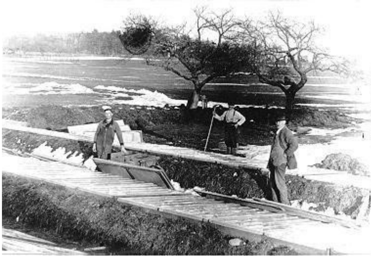
Title: First cold frames made on the Unsworth farm, Plains Road, from the windows of the Crystal Palace, Hamilton Date: ca 1897