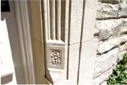
CAST STONE DETAILS AT FRONT ENTRANCE