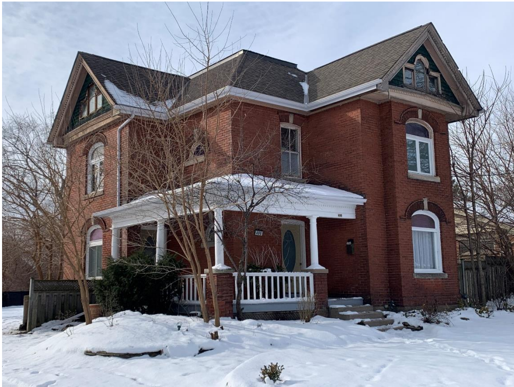
Front (west) and side (south) elevation of 496 Walker's Line