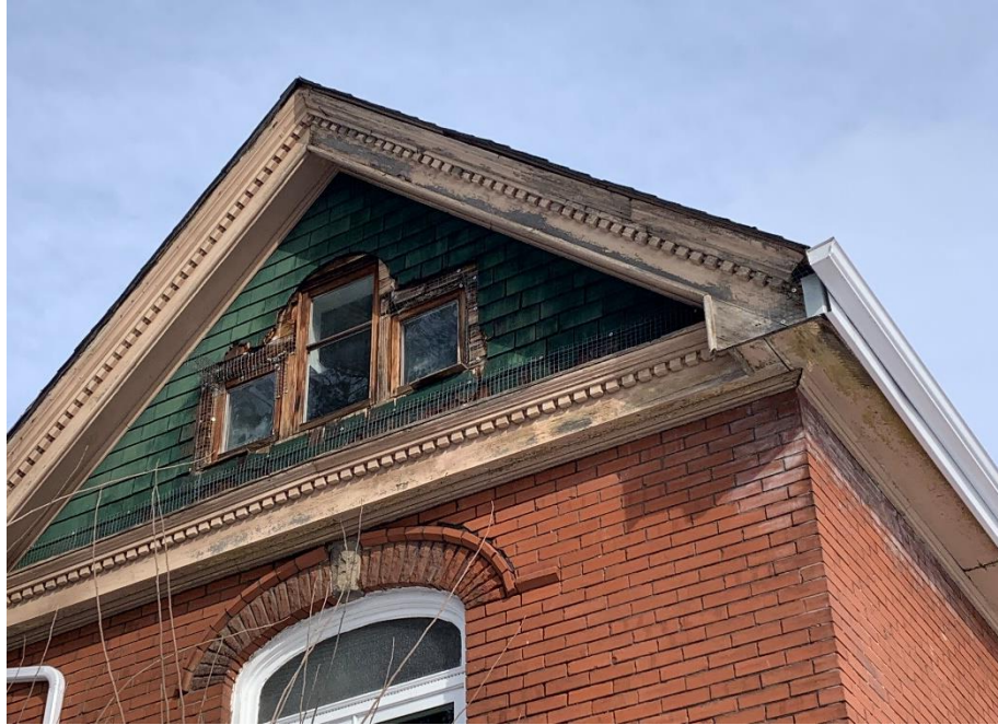
Deteriorated Palladian window in gable on south side elevation