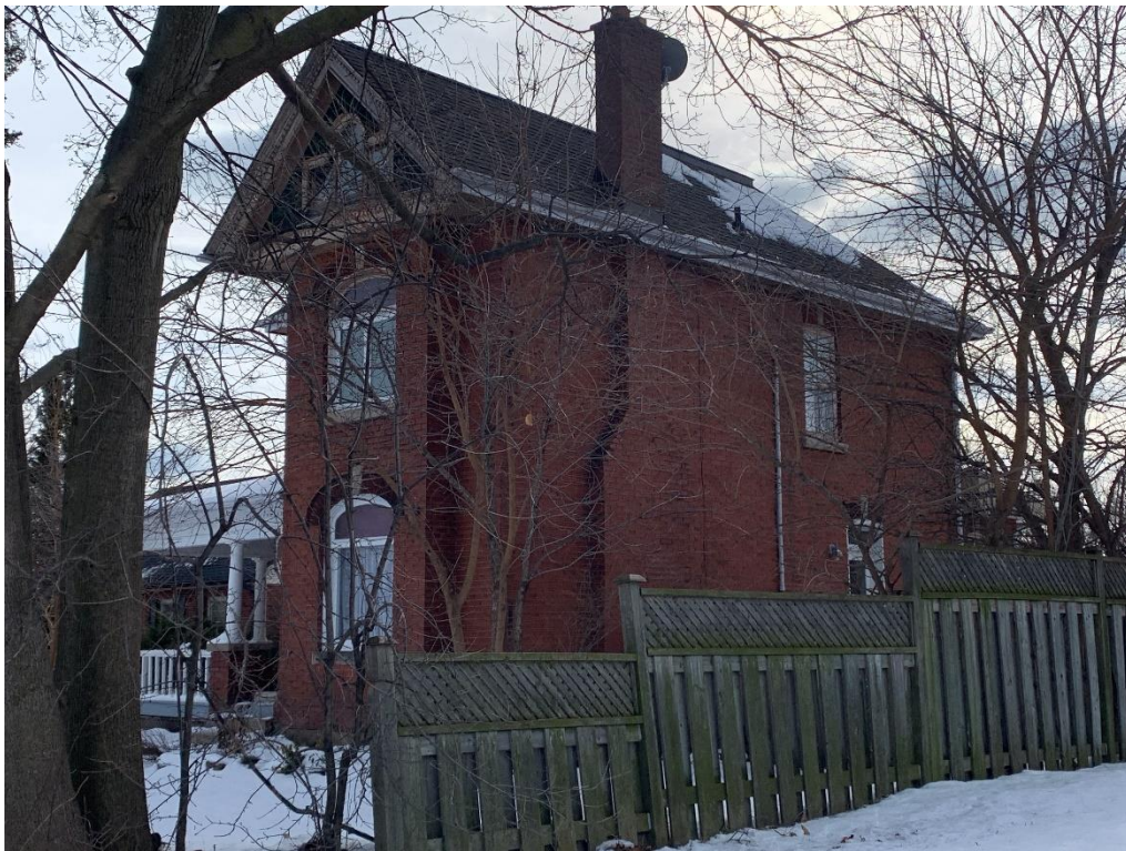
Front (west) and side (north) elevation of 496 Walker's Line