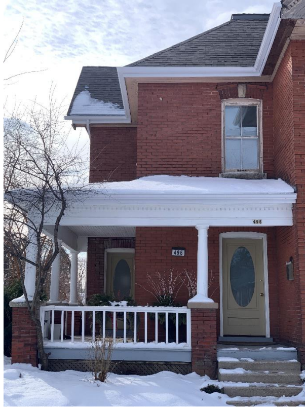
Front (West) elevation- Front Porch