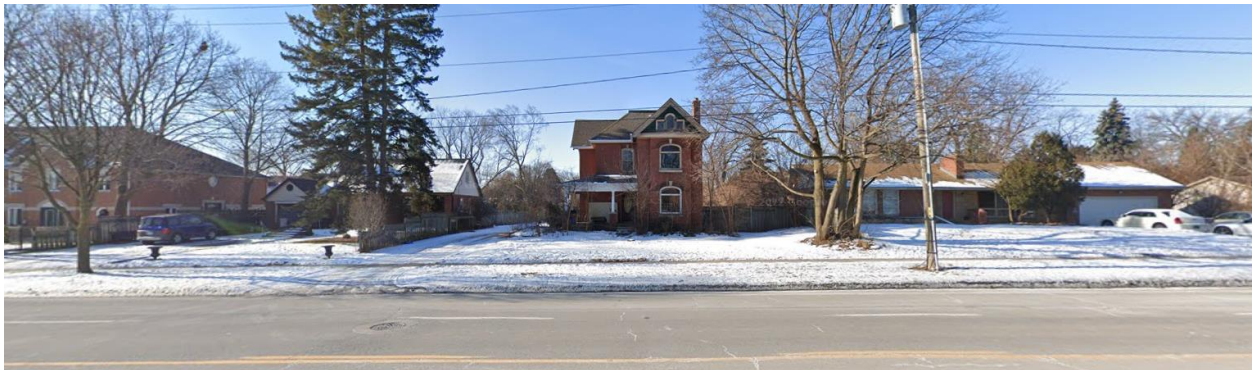
Streetscape- 496 Walker's Line