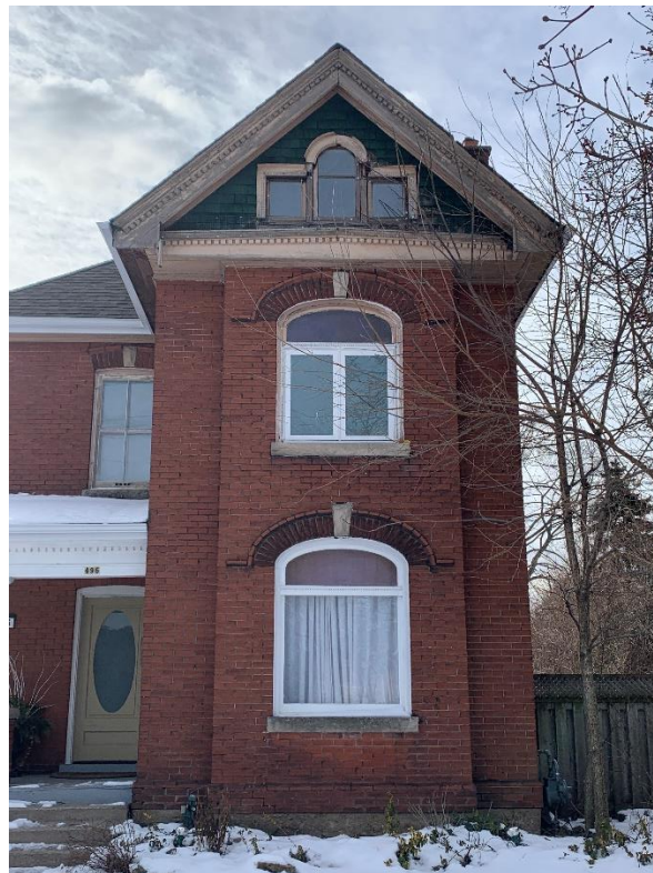
Front (West) elevation with Palladian window in gable.