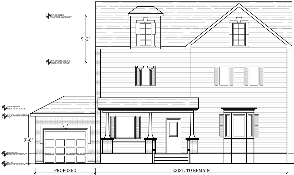
2 A101 FRONT ELEVATION SCALE: N.T.S