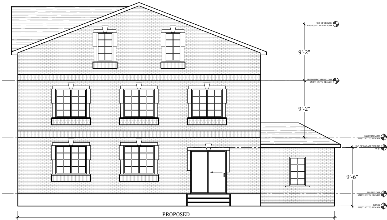
3 A101 REAR ELEVATION SCALE: N.T.S