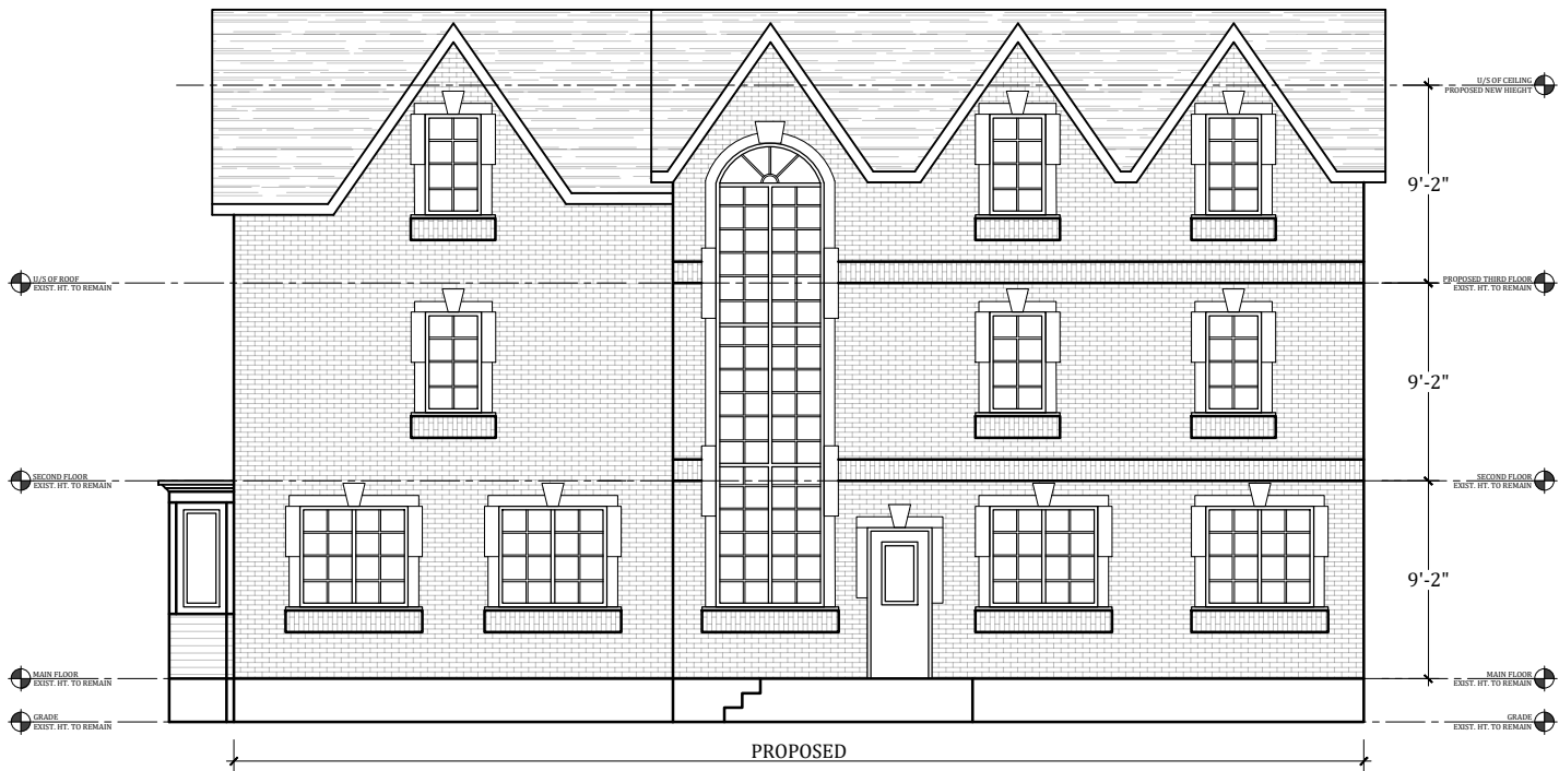
1 A101 SIDE ELEVATION SCALE: N.T.S