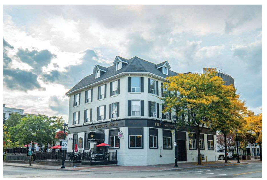
The Queens Hotel/Sherwood Inn, c. 1860, 400 Brant St, non-designated heritage property