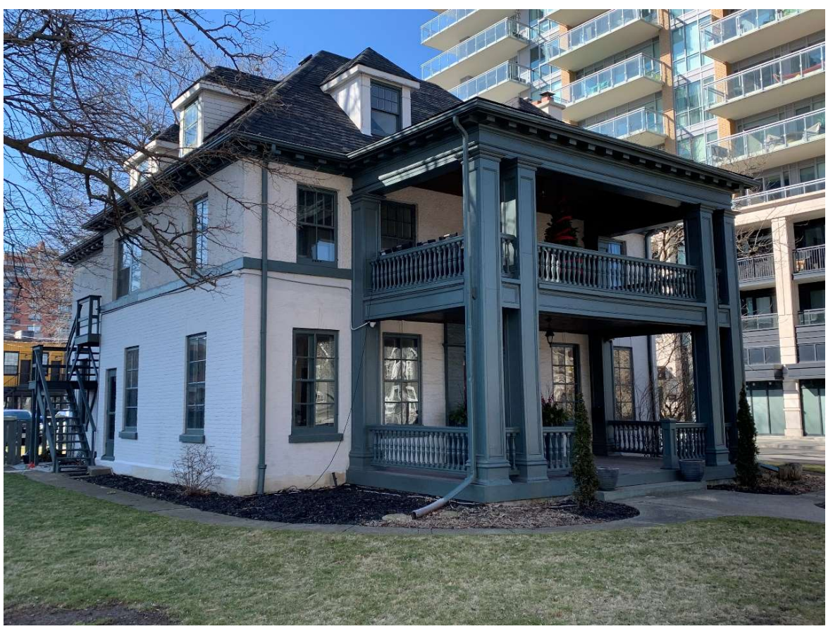
490 Elizabeth Street, c. 1855, non-designated heritage property