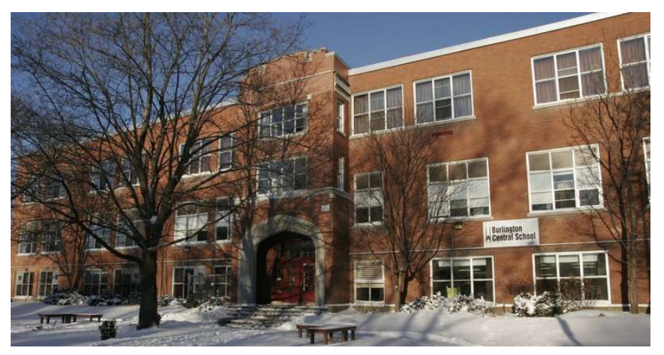
Burlington Central High School, c. 1922, 1433 Baldwin St, non-designated heritage property