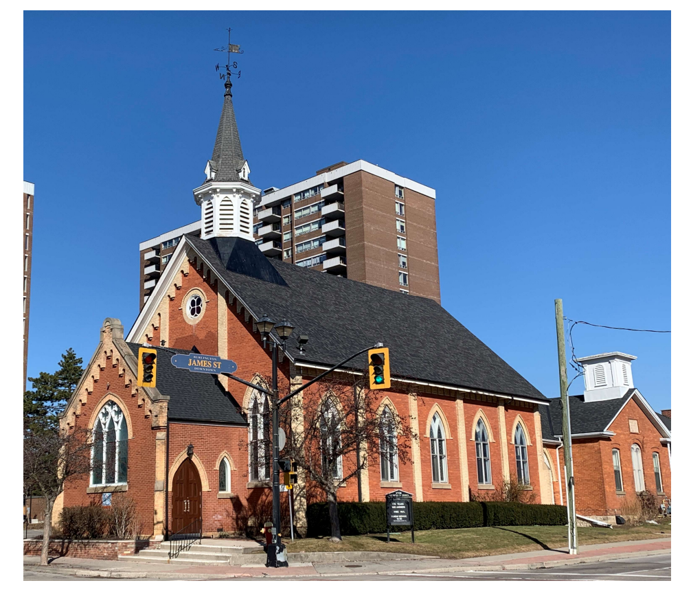
Knox Presbyterian Church, c. 1865, 461 Elizabeth Street, non-designated heritage property