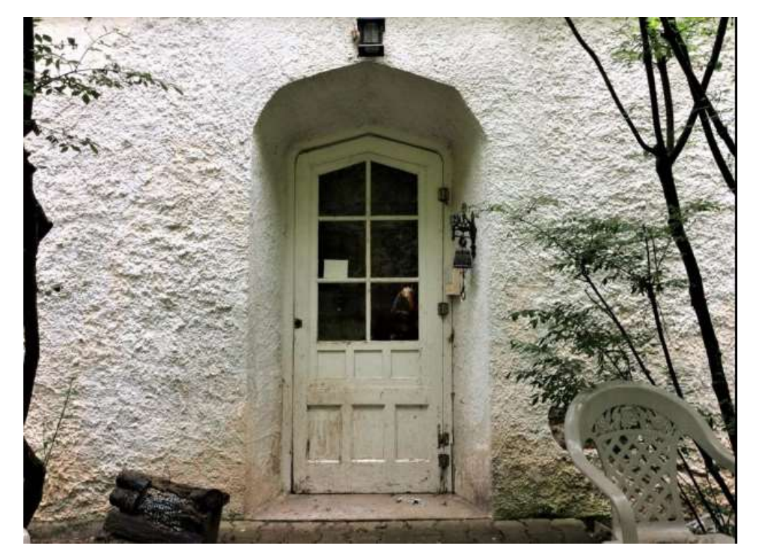
Stewart Spence House (entrance), c. 1832, 176 Rennick Road, non-designated heritage property