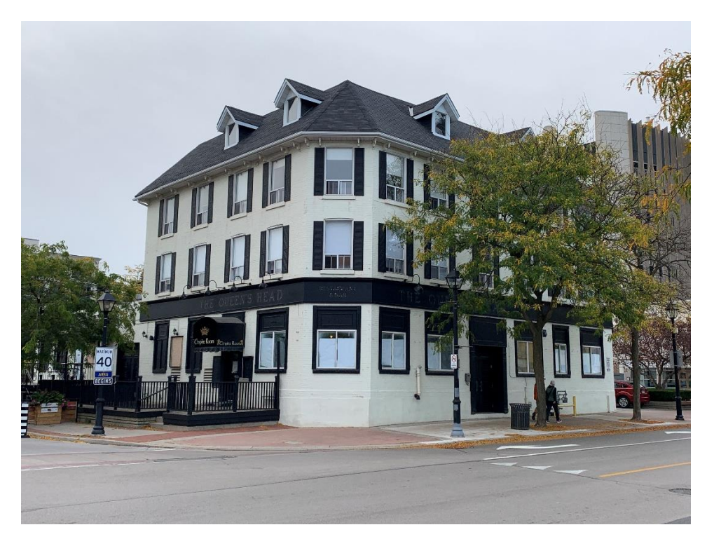
Photo of Chamfered corner and elevations facing Brant Street and Elgin Street