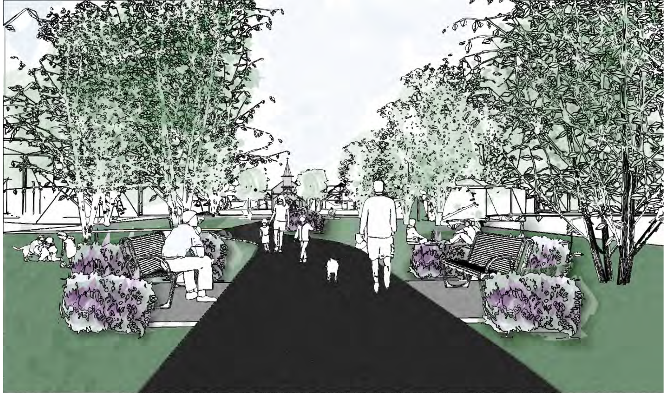
CHURCH AVENUE - VIEW ALONG PATH LOOKING TOWARD CHURCH (P2)