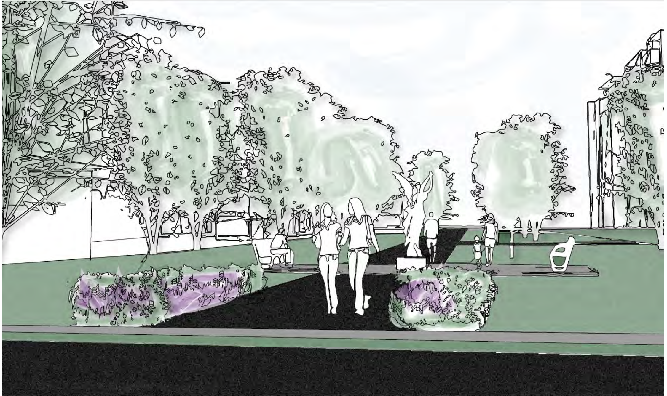
CHURCH AVENUE - VIEW FROM ELGIN ST. LOOKING TOWARD LAKE (P1)