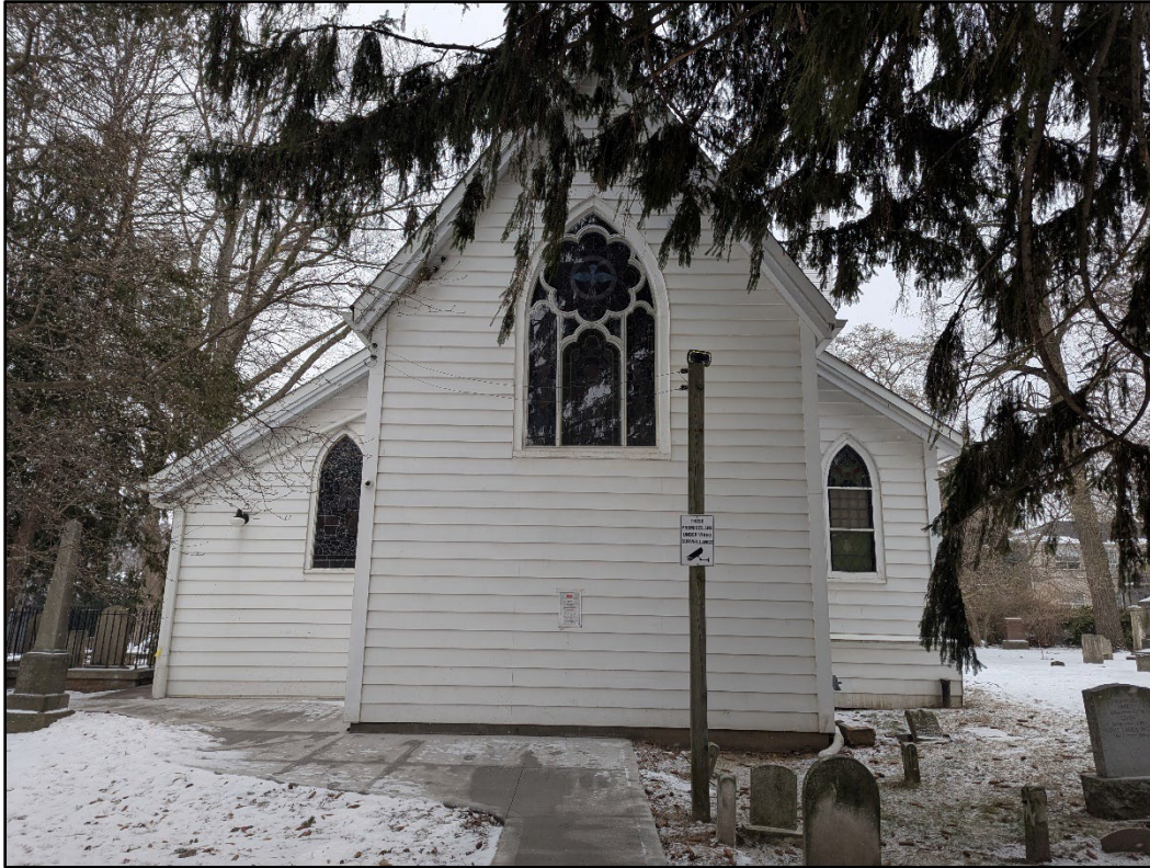
Figure 3: Rear (Northwest) Elevation St. Luke's Anglican Church