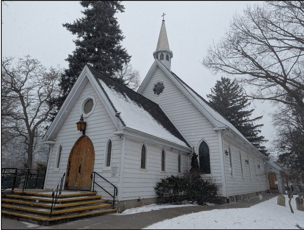
Figure 5: Northeast Corner of St. Luke's Anglican Church