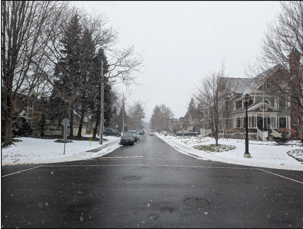
Figure 7: View Northwest from the Church through Hager Ave.