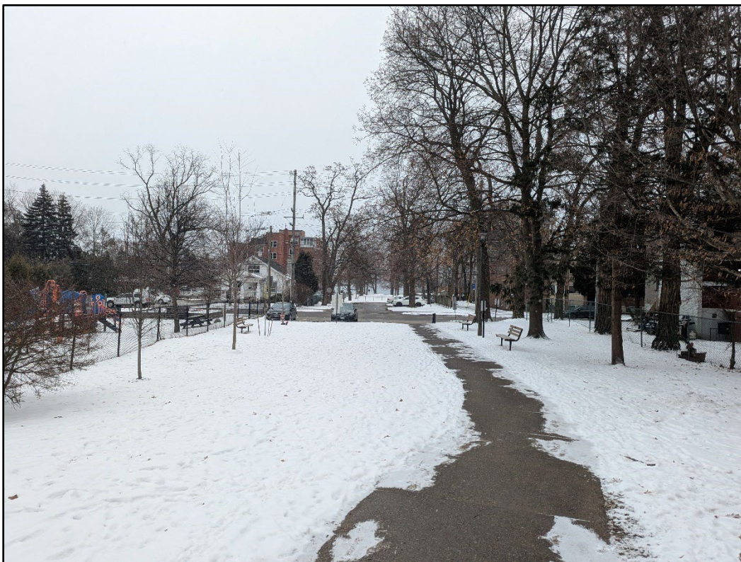
Figure 6: View Southeast from the Church through the Row of Mature Trees