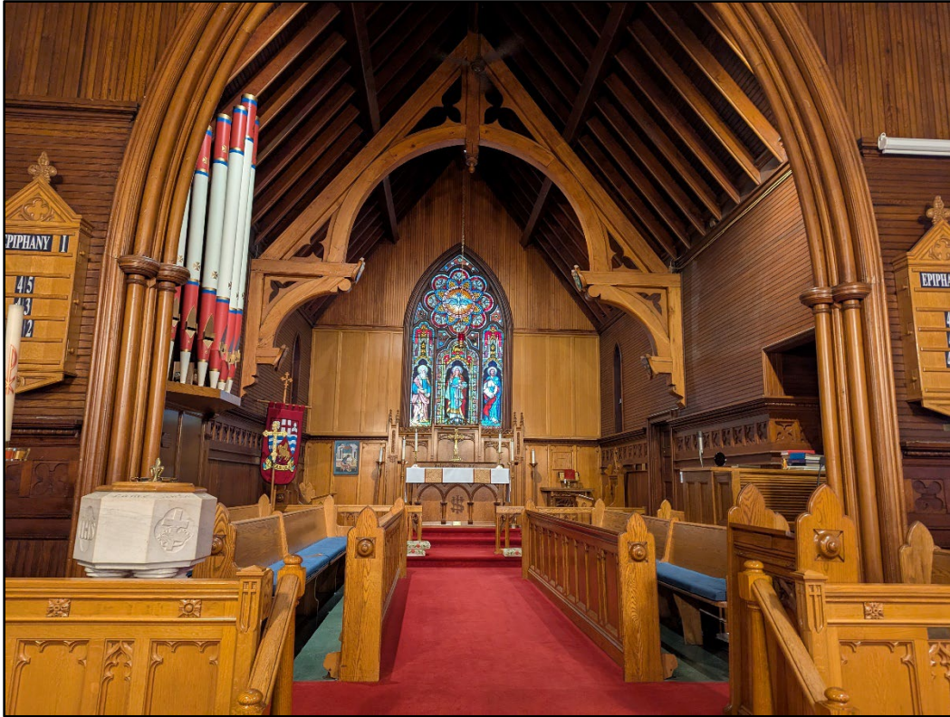
Figure 9: The Interior of St. Luke's Anglican Church