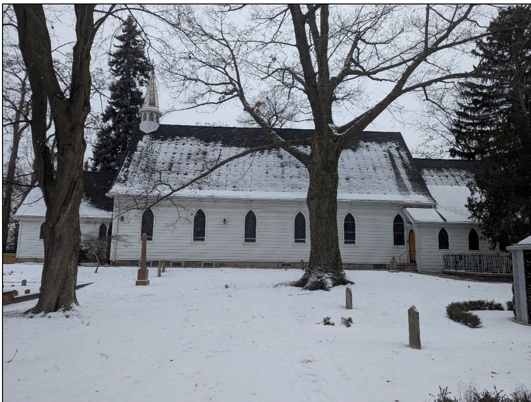
Figure 4: Side (Northeast) Elevation of St. Luke's Anglican Church