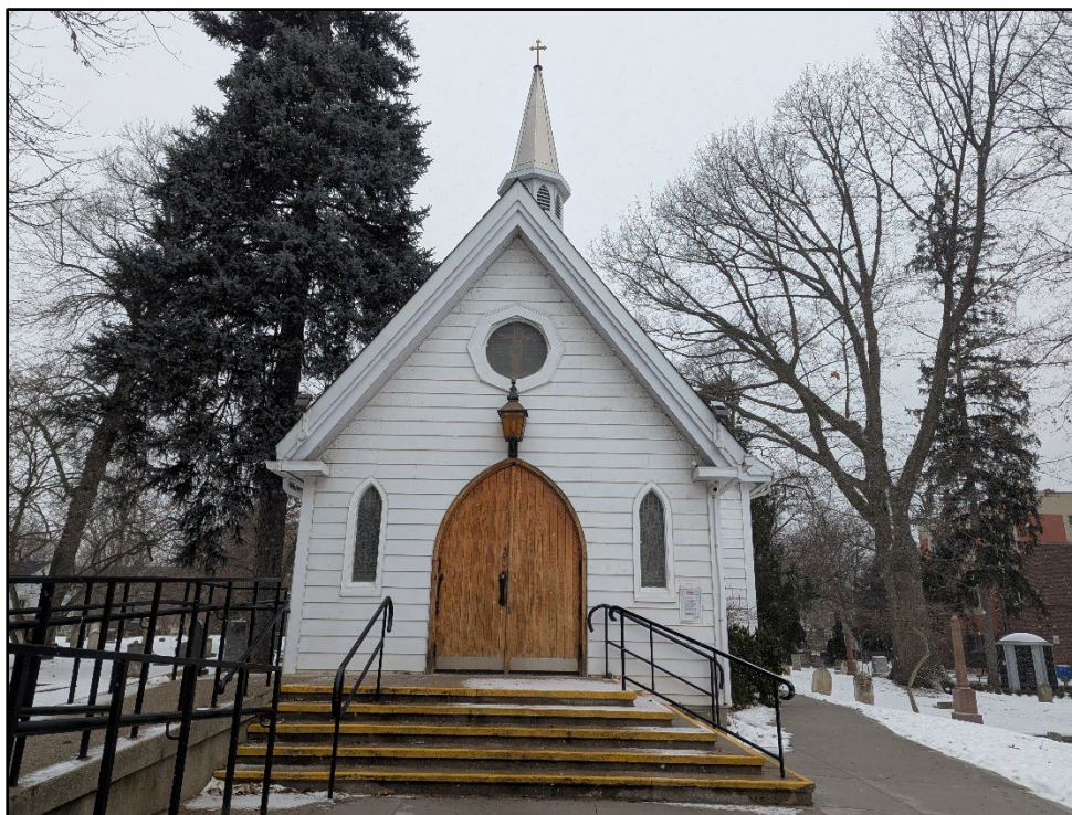
Figure 1: Front Elevation of St. Luke's Anglican Church