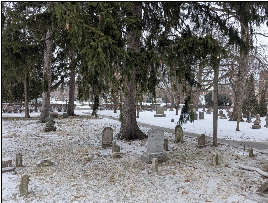
Figure 8: A Portion of St. Luke's Anglican Church Cemetery to the Rear of the Church