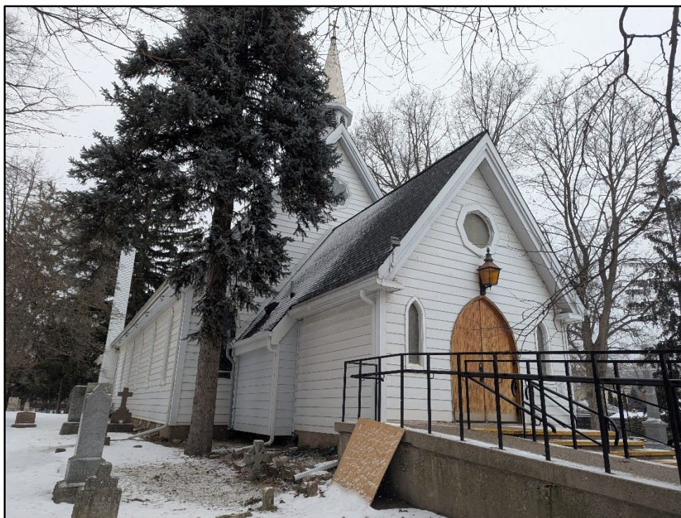
Figure 2: Southwest Corner and Side Elevation St. Luke's Anglican Church