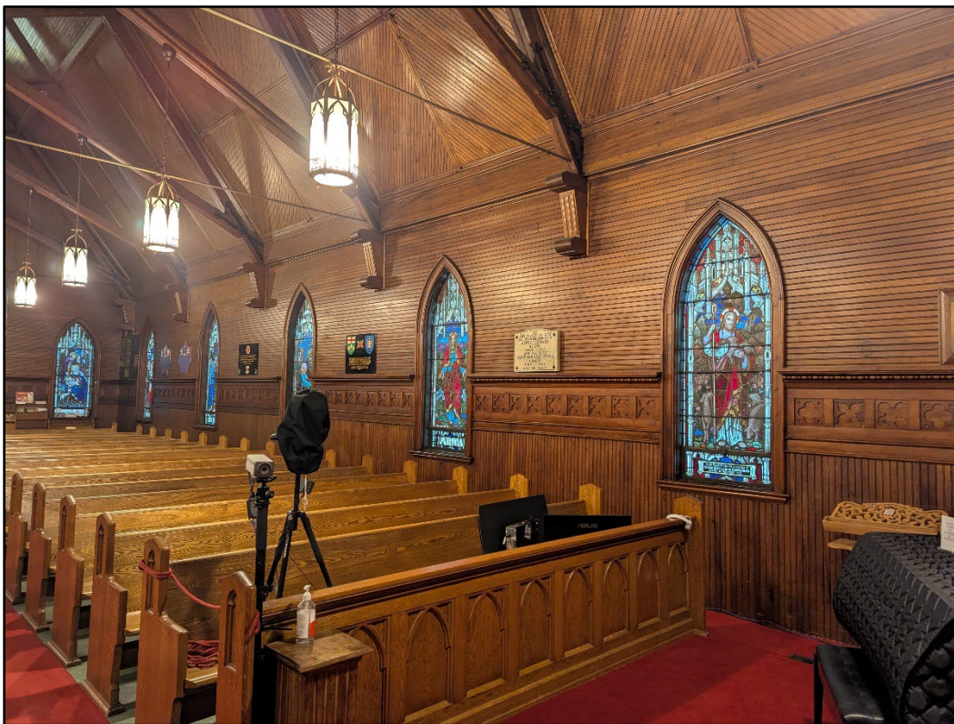
Figure 10: The Interior of St. Luke's Anglican Church