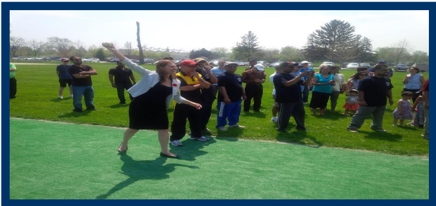
BURLINGTON CRICKET COMMUNITY — CENTRAL PARK